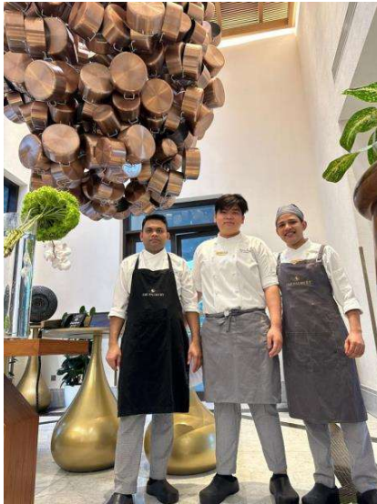
Appendix 2. Rockfish Team