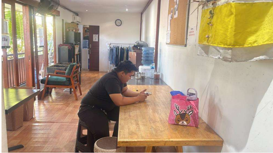
Figure 3.12 Break Place