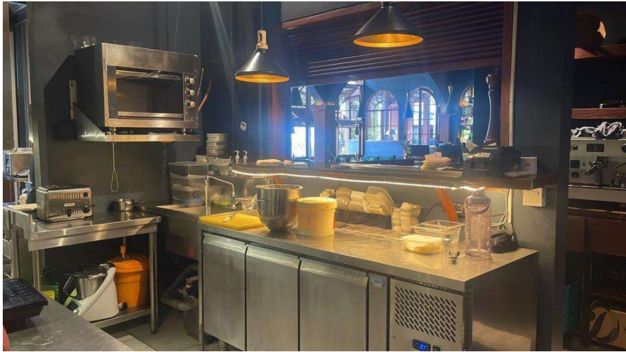
Figure 3.10 Pass Section