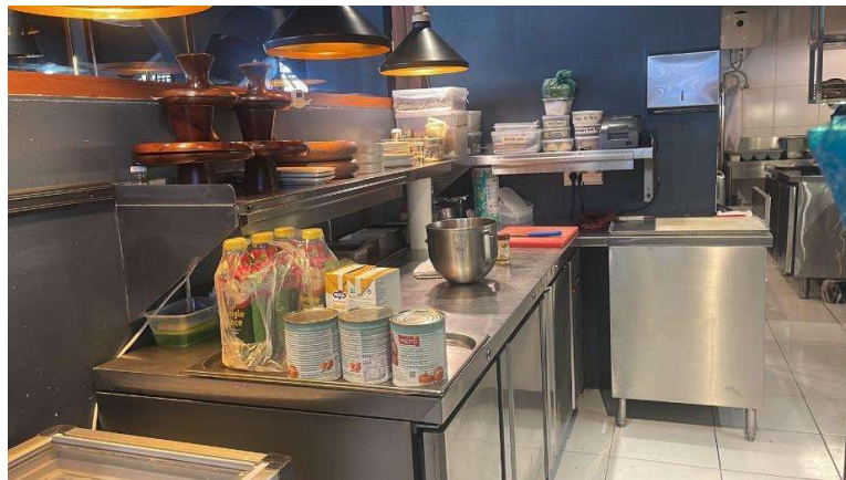
Figure 3.9 Cold & Pastry Section