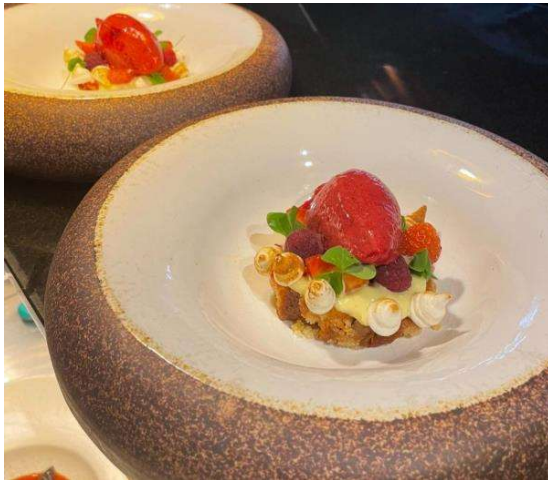
Figure 3.7 Burnt Berries Meringue

A soft chocolate cake served with vanilla ice cream, passion fruit jam, almond soil & torched marshmallow.