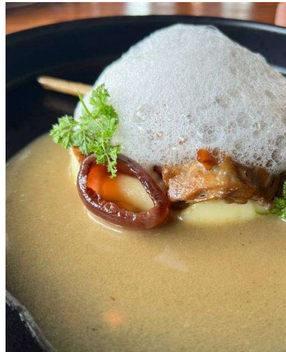
Figure 3.14 Lapin a la Moutarde (rabbit cooked with Dijon mustard)

The Chinese New Year signals the end of the winter period and is a sign of new growth to come. Unlike the Western New Year, which is based on the Gregorian calendar, the Chinese New Year is determined by the Chinese lunar calendar, which means that the official date changes each year. For 2023, the Chinese New Year will start on Sunday 22 January and will celebrate the Year of the Rabbit.