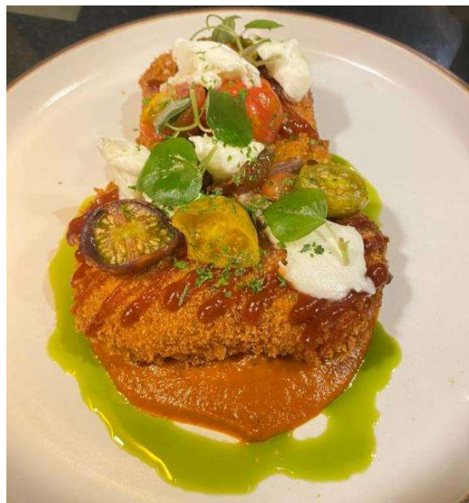
Figure 3.5 Kongs Breaded Chicken

Served with clams, baby courgetti, tomato butter sauce, capers, lemon and hazelnut.