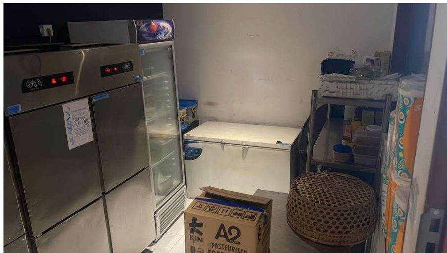
Figure 3.11 Dry Store