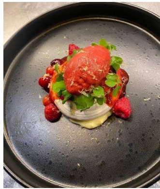
Figure 3.15 Berry Pavlova

Easter also called Pascha, is a Christian festival and easter cultural holiday commemorating the resurrection of Jesus from the dead. Kong provides several special menus for Easter, such as Oyster Rockefeller, Slow cooked lamb, and Berry Pavlova.