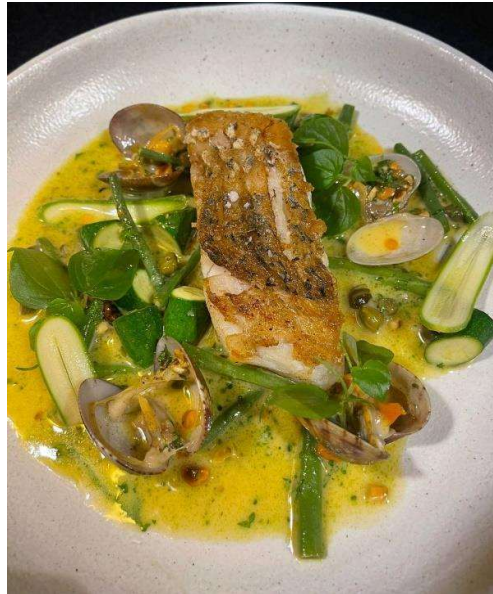
Figure 3.4 Seared Barramundi

Served with clams, baby courgetti, tomato butter sauce, capers, lemon and hazelnut.