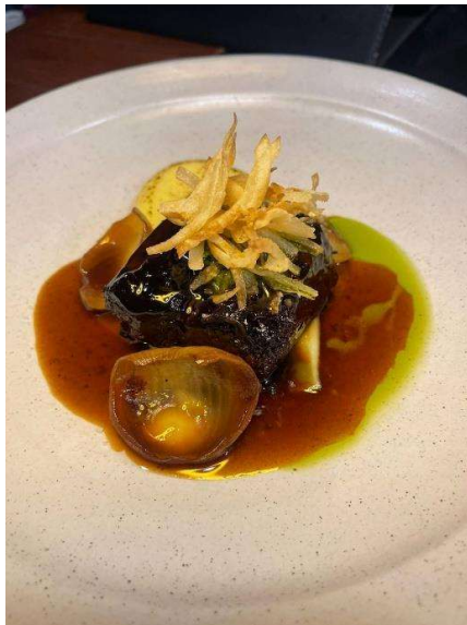
Figure 3.3 Red Wine Braised Short Rib

Organic beetroot with pickled radish whipped goat cheese, sunflower seeds.