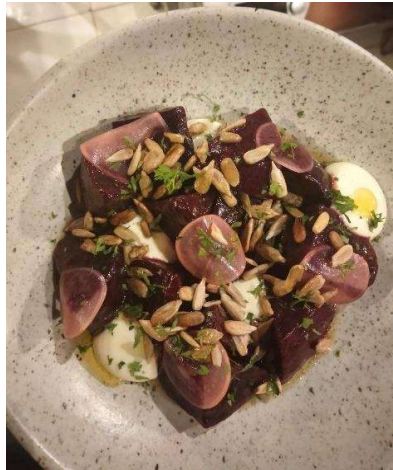
Figure 3.2 Beet Root Side

Organic beetroot with pickled radish whipped goat cheese, sunflower seeds.