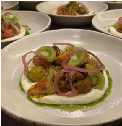
Figure 3.1 Ricotta Salad

Organic tomatoes from Baturiti farm served on a bed of whipped ricotta cheese art sun-dried tomato jam, topped with basil