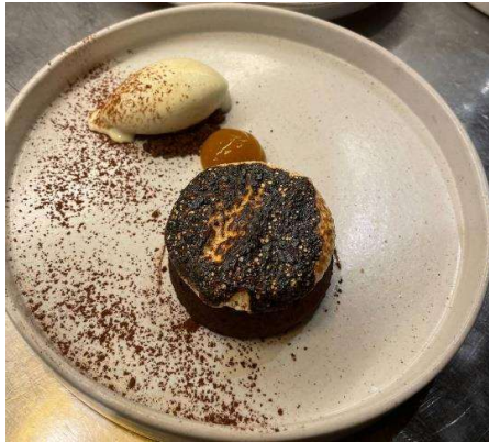
Figure 3.6 Chocolate Fondant

A soft chocolate cake served with vanilla ice cream, passion fruit jam, almond soil & torched marshmallow.