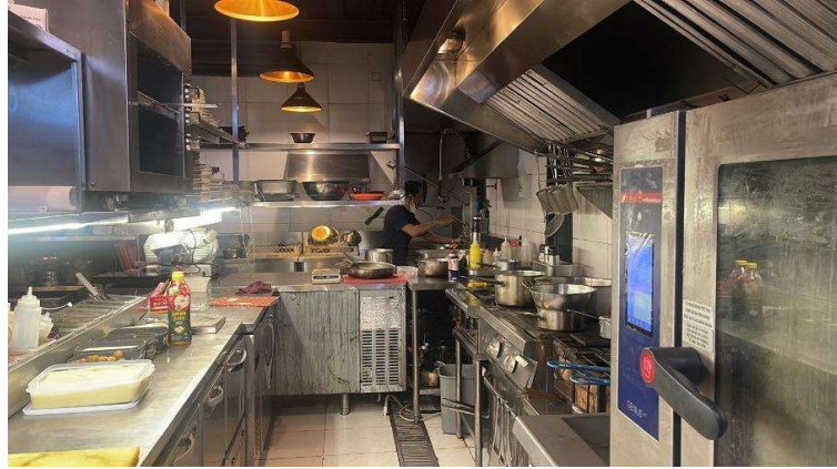
Figure 3.8 Hot Section