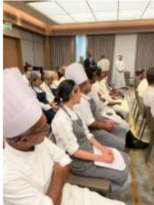
Figure 4.2 Main Kitchen Team at General Meeting

The memorable moments in the main kitchen was when there is General Meeting where all the kitchen needs to be prepare few items of food, from cold kitchen side we prepare salads and really unforgettable moments that the writer join on the meeting with other colleagues with a lot of fun games.