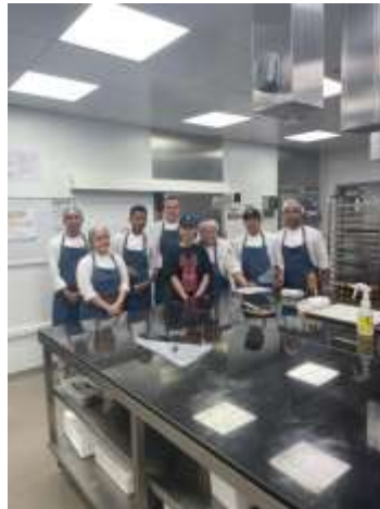
Figure 4.1 Pastry Team