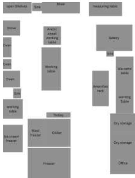
Figure 4.5 Pastry & Bakery Layout