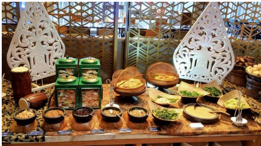
Figure 3. 17 Tradisional Buffet