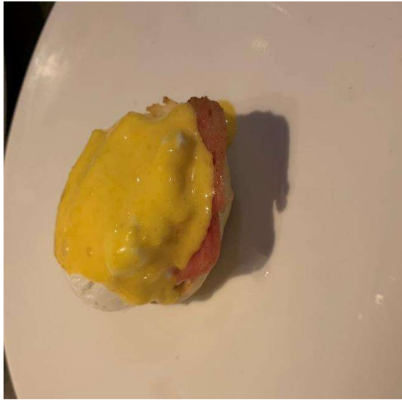
Figure 3. 7 Egg Benedict