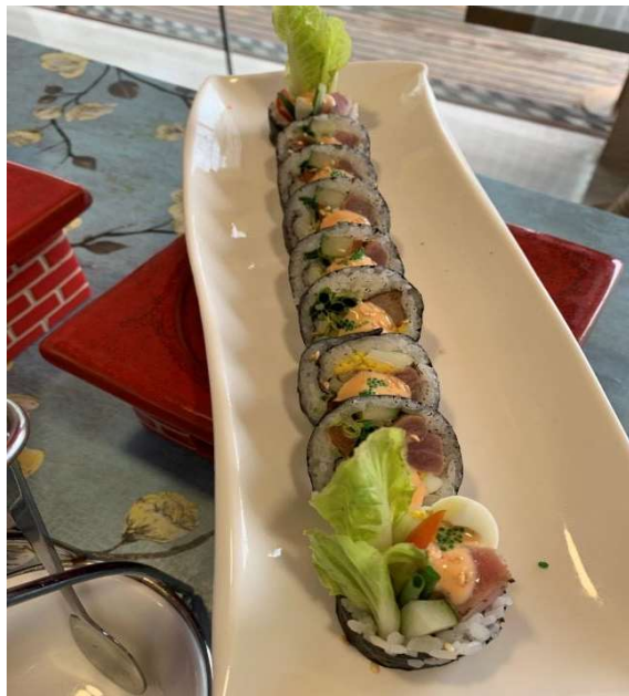
Figure 3. 15 Tuna Tamago Futomaki