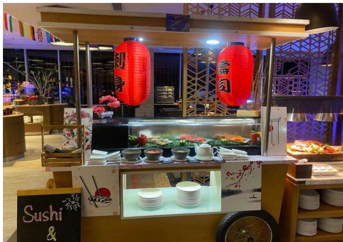
Figure 3. 19 Japanese Live Station