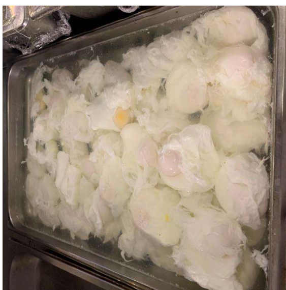
Figure 3. 5 Poach Egg