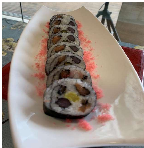
Figure 3. 11 Tuna Daikon Futomaki