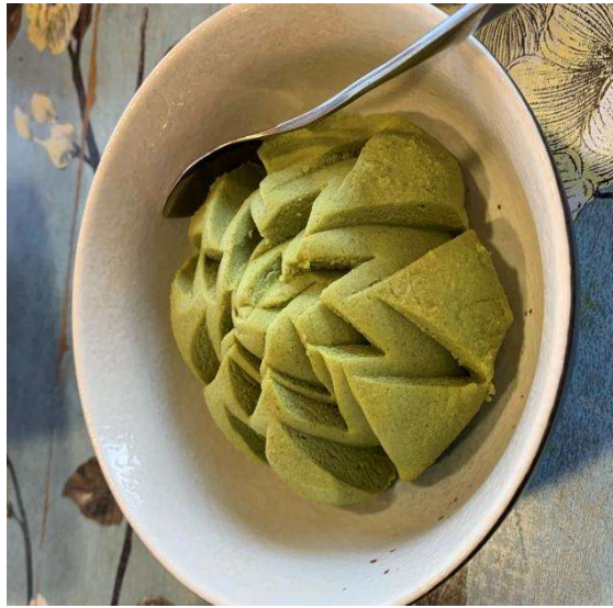
Figure 3. 10 Wasabi Decoration