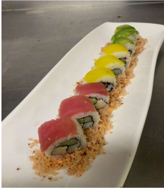
Figure 3. 16 Rainbow Uramaki