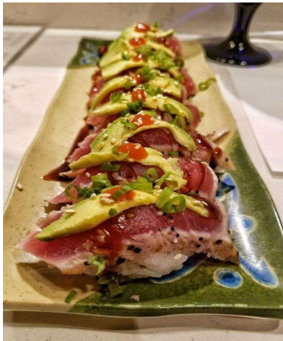
Figure 3. 13 Tuna Tataki Uramaki