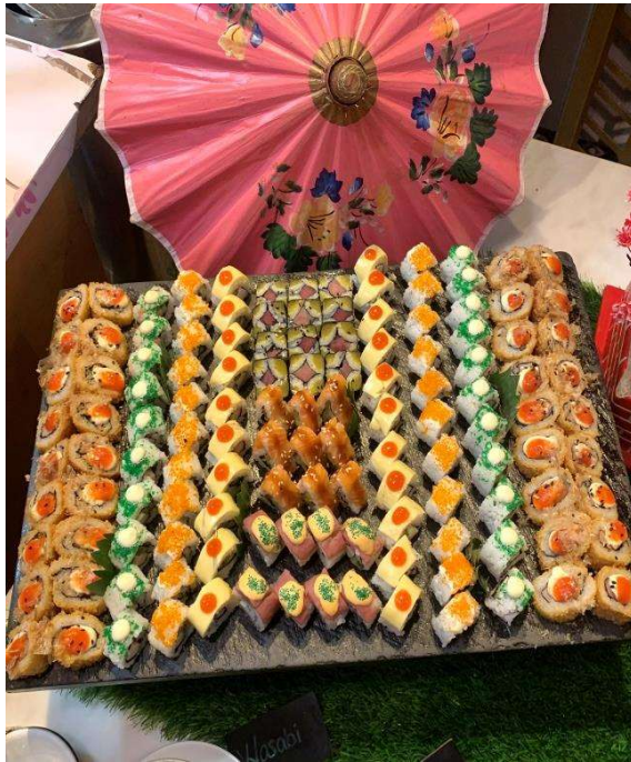
Figure 3. 14 Vasa Special Sushi Platter