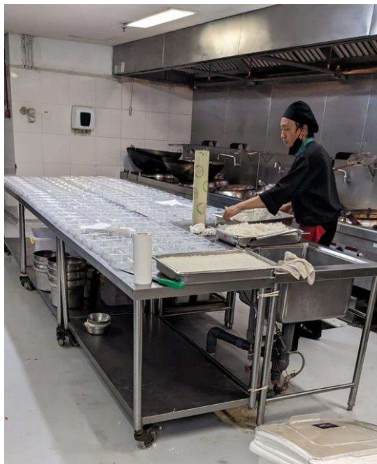
Figure 3. 27 Banquet Kitchen