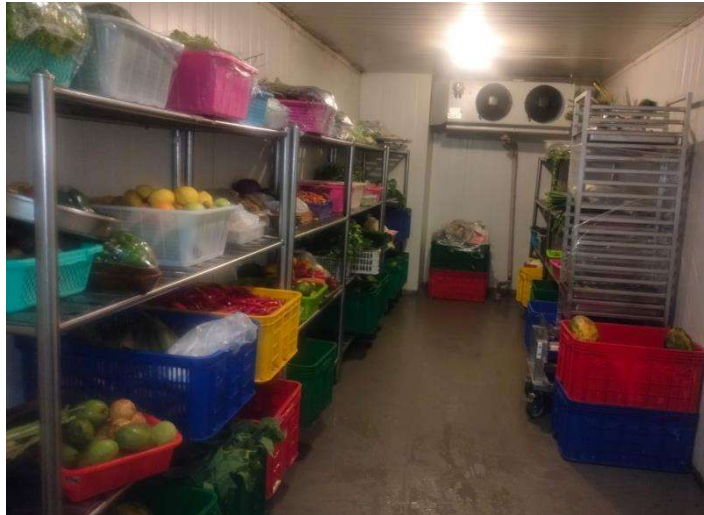
Figure 3. 18 Walking Chiller