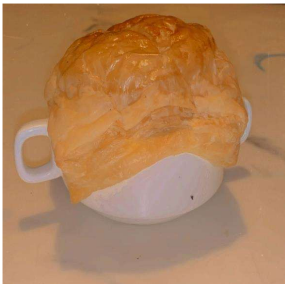
Figure 3. 3 Zuppa Soup