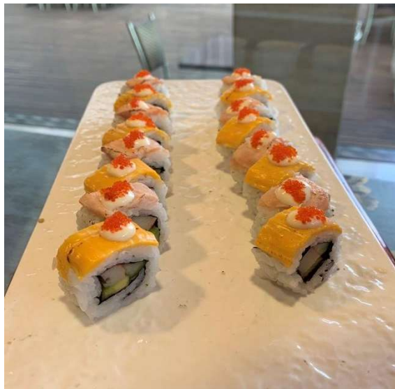
Figure 3. 9 Kani Cheese Uramaki