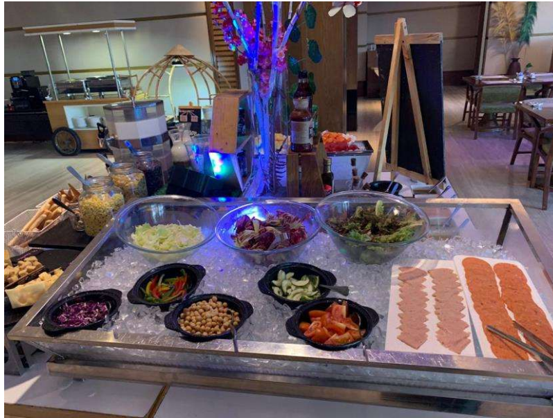
Figure 3. 22 Salad Station