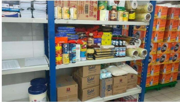
Figure 3. 20 Store Request