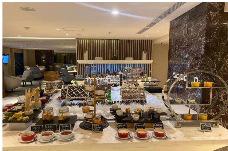
Figure 3. 25 Executive Lounge