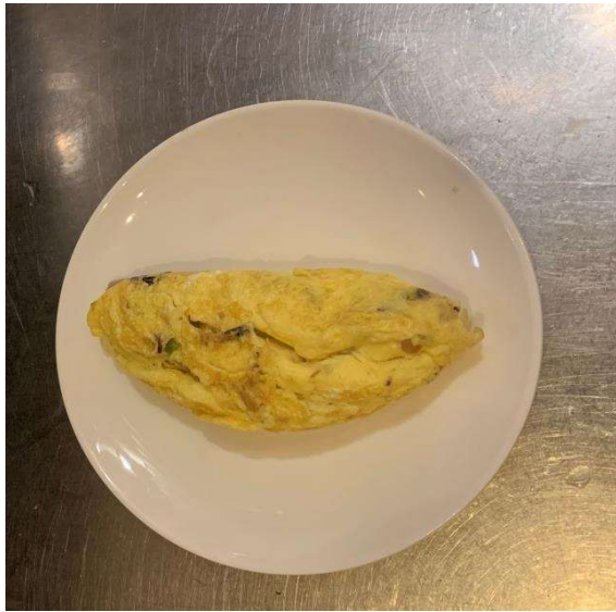
Figure 3. 6 Omelette