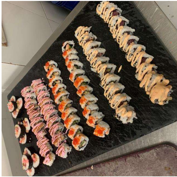
Figure 3. 8 Sushi Platter