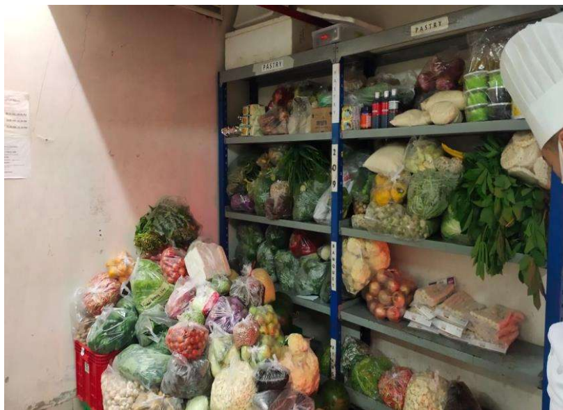
Figure 3. 23 Receiving Station