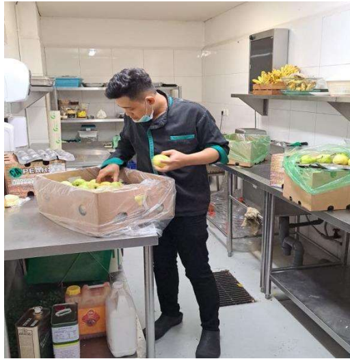
Figure 3. 24 Cold Kitchen