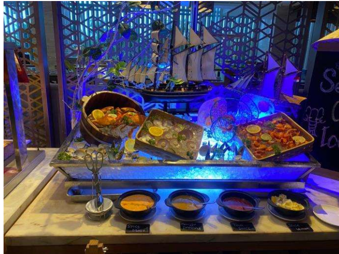
Figure 3. 26 Seafood On Ice