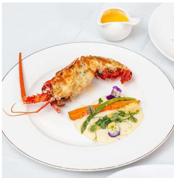
Figure 3. 1 Lobster Thermidor