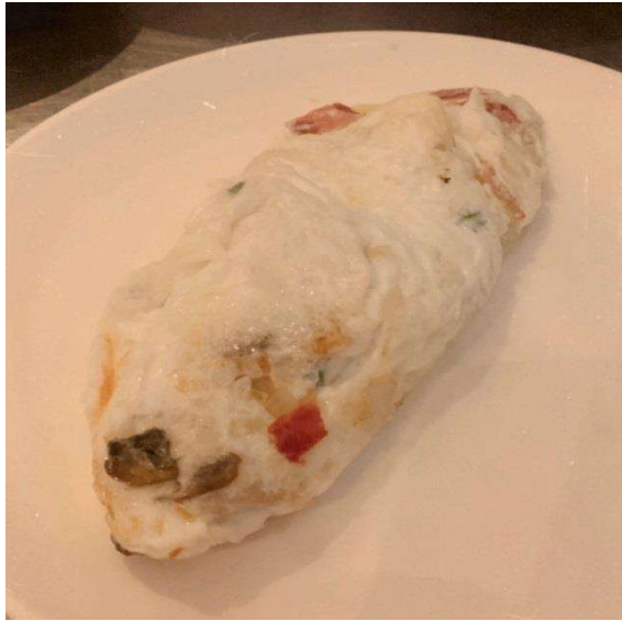
Figure 3. 2 White Omelette