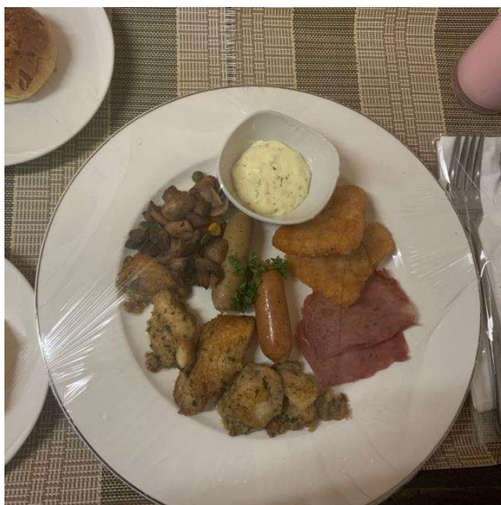
Figure 3. 4 English Breakfast