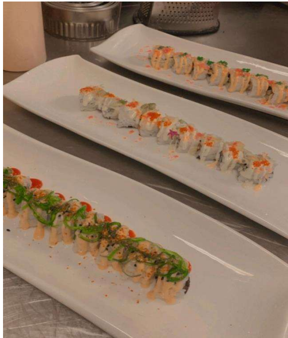
Figure 3. 12 Uramaki Platter