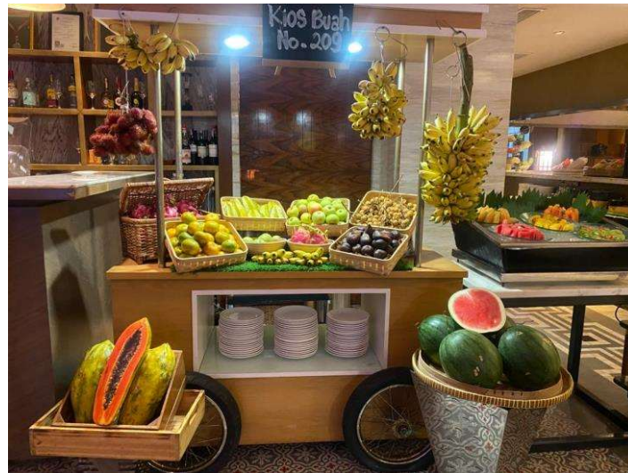
Figure 3. 21 Whole Fruit Station