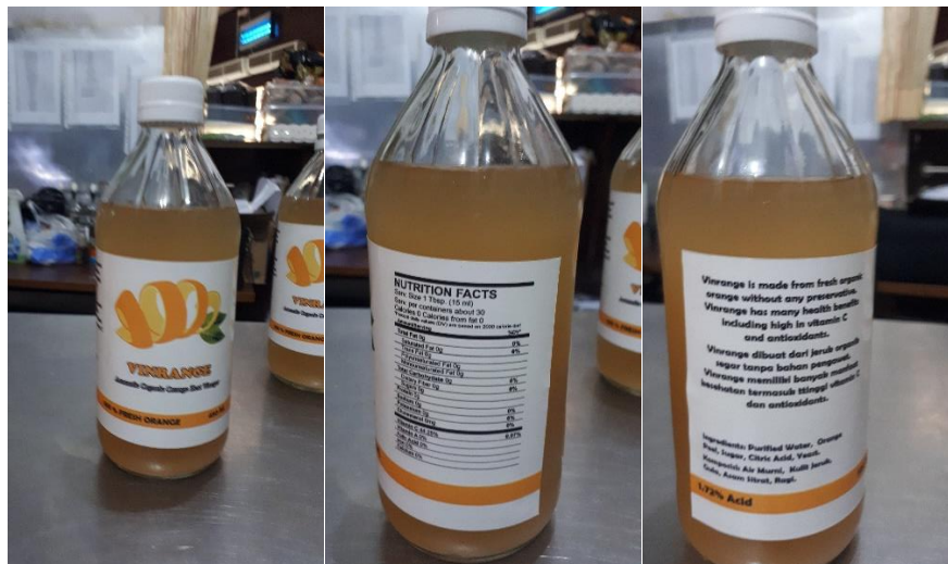
Picture. Label on the Bottle.