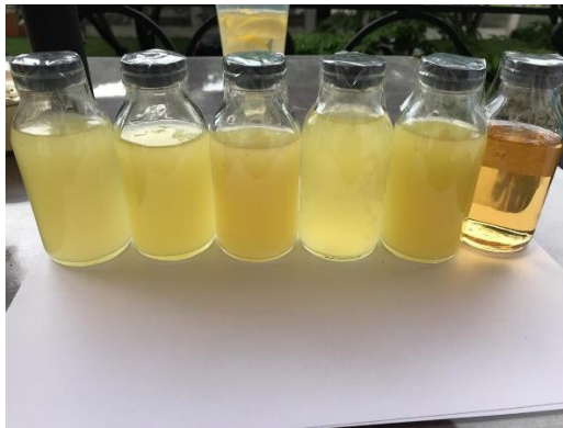
Picture. Samples of vinegar for laboratory test.