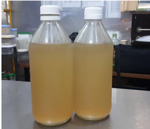
Picture. Vinegar Inside the Packaging Bottle.