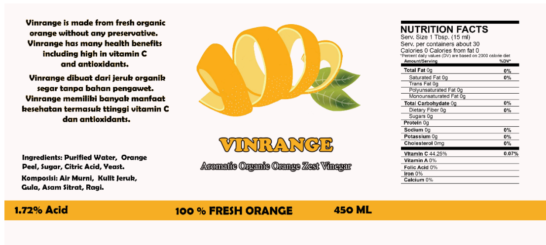
Picture. Sticker Label.