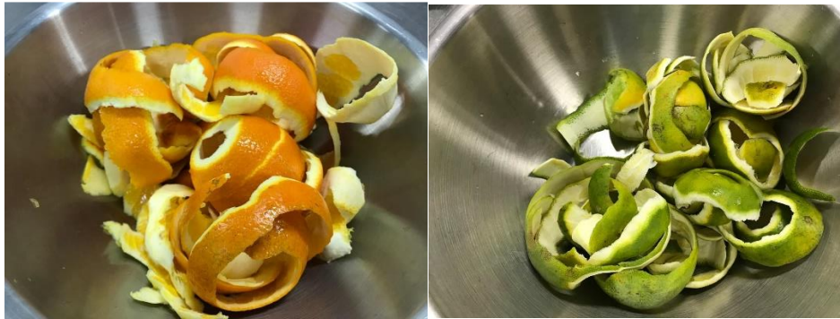
Picture. Orange peel after washed and peeled.