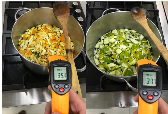
Picture. Boiling and pasteurizing orange peel.