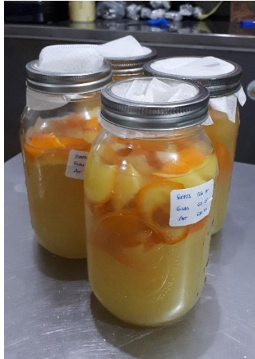
Picture. Orange mixture after adding citric acid.