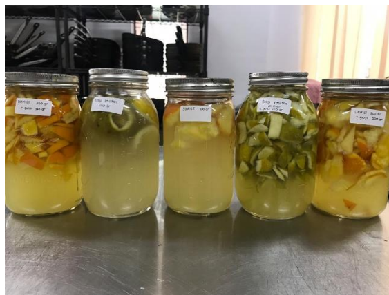
Picture. The orange peel mixture put inside sterile jar for fermenting.