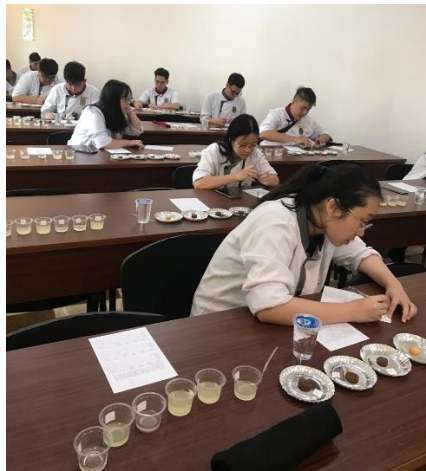
Picture. Sensory test process.