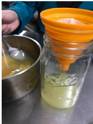
Picture. Filtering and pasteurizing process.