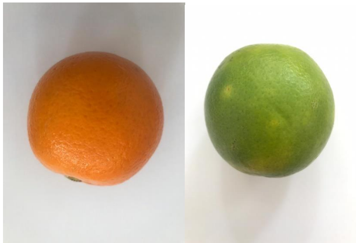
Picture. Orange used for trial (left: Sunkist, right: Baby Pacitan).