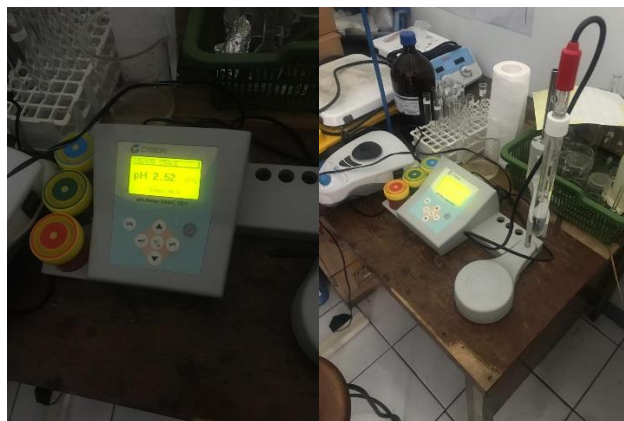
Picture. Equipment used for testing.