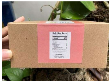
Figure 29. Pumffle Packaging