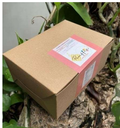
Figure 30. Pumffle Packaging