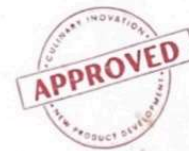
Figure 34. Scan Sensory Test