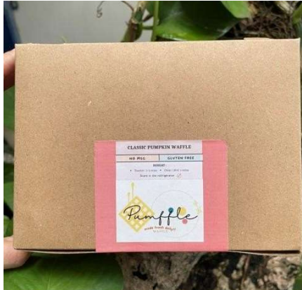
Figure 28. Pumffle Packaging