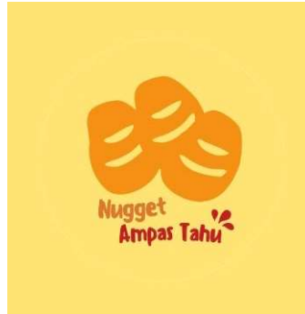
Appendix 2. PACKAGING DESAIN