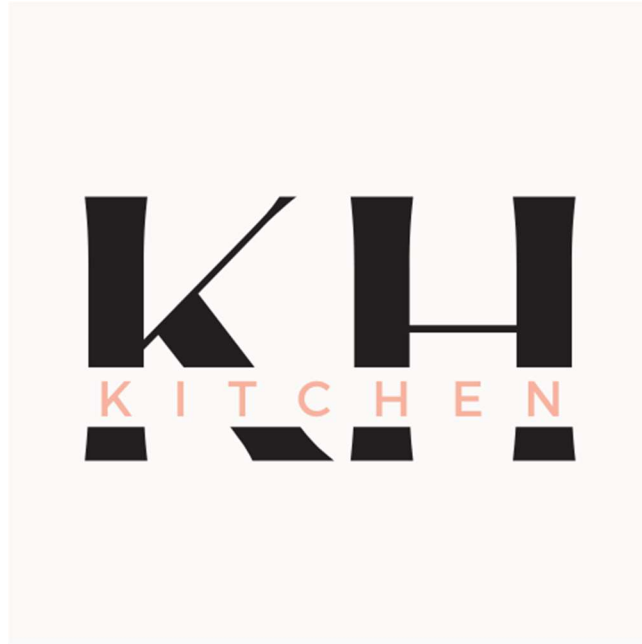
Picture 19. Brand Logo