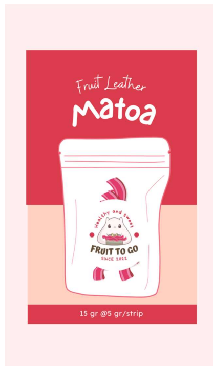
Figure 35. Front Packaging sticker