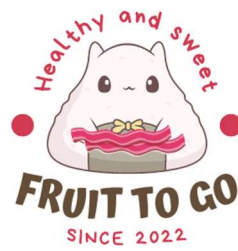
Figure 34. Logo