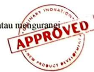
Figure 38. Scanned Approved Recipe