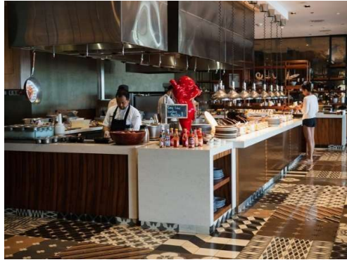
Picture 6 clay craft kitchn