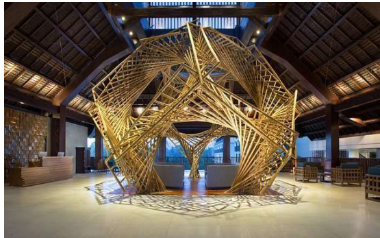
Picture 2 Element by Westin Ubud Lobby