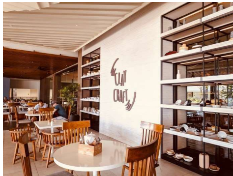
Picture 7 Clay craft dining area