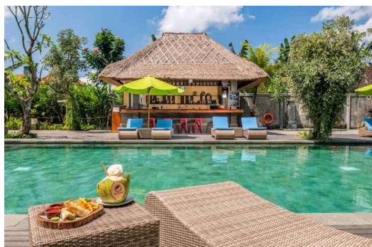
Picture 4 Andong teras pool abr