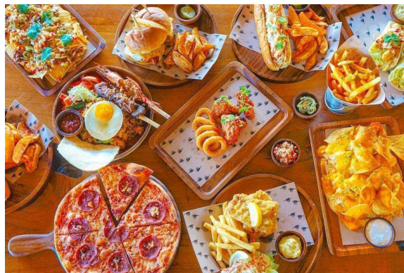
Picture 8 Clay Craft's food