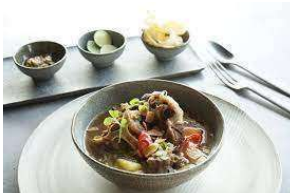
Picture 11 Double ikat's food