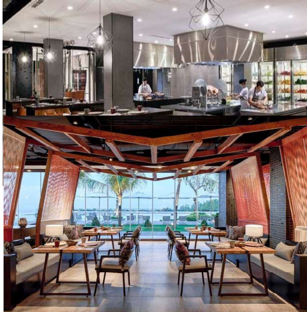
Picture 10 Double ikat Dining area