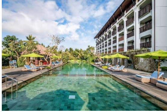
Picture 1 Element by Westin Ubud