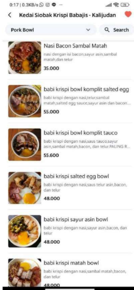
Picture 36. Menu in the Grabfood App