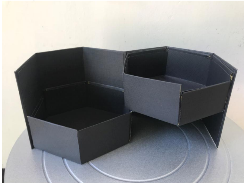
Picture 35. Packaging Inner Look