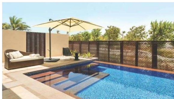
Figure 14. 1 Bedroom with Garden View Villa

120 sq m villa surrounded by dunes and nature, offering a luxury, contemporary style combined with a residential feel and distinct UAE cultural touches. Featuring separate bedrooms, living room, large terrace with private pool, rain shower and sun loungers.