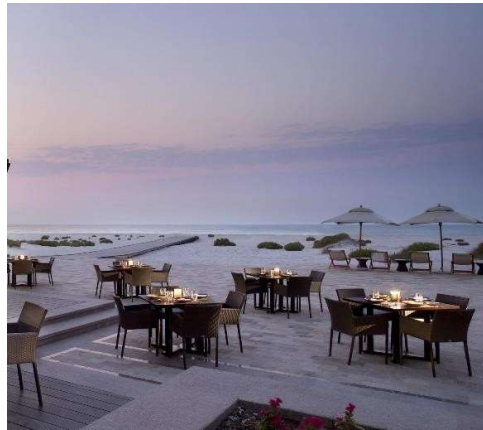
Figure 24. Vayu Beach Bar

Bar located on the beach and only open at night times.