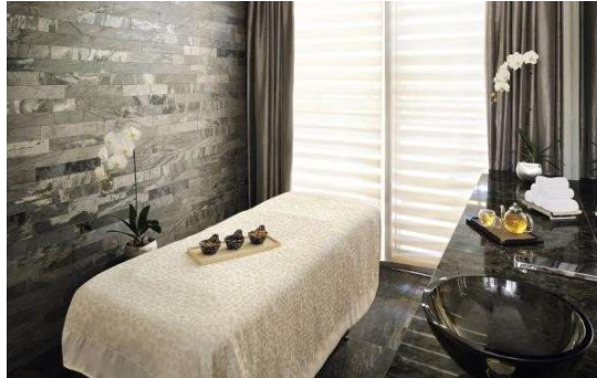
Figure 18. Atarmia Spa

Spa for guests to relax their body and mind and served with our warm specialty drinks.