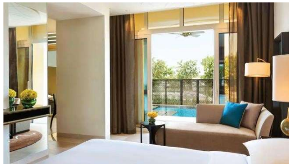
Figure 17. 2 Bedroom with Garden View Villa

170 sq m villa featuring two bedrooms, living room, large terrace with private pool, rain shower, sun loungers, offering stunning views of the Arabian Sea.