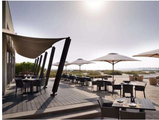
Figure 21. Beach House Restaurant

Japanese and Italian fusion restaurant with a stunning beach view.