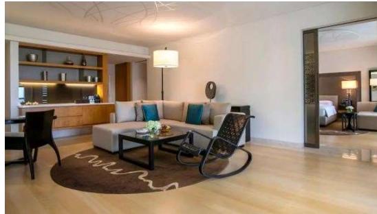
Figure 3. Park Executive Suite

130 sq m room combining contemporary style with UAE's cultural touches featuring separate bedroom, living room, and two large balconies.