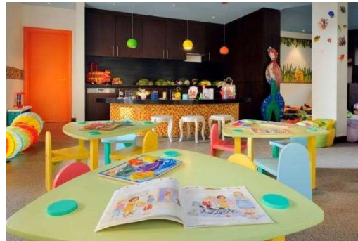
Figure 25. Camp Hyatt for Kids

A place for parents to keep their kids to play while they enjoy their times at the hotel.