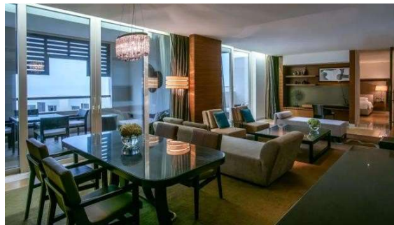
Figure 7. Prince Suite

275 sq m room furnished with dining table up to 10 guests, plush sofas, armchairs, smart TV, luxurious bathrooms, maid's room, plunge pool, four sunbeds, private outdoor massage area.