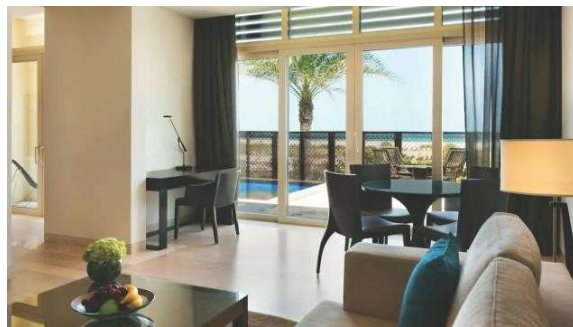
Figure 16. 2 Bedroom with Beach View Villa

355 sq m villa furnished with spacious living room, master bedroom, maid's room, large outdoor terrace with private pool and sunbeds with the stunning views of the Arabian Sea.