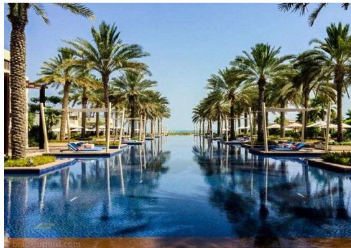
Figure 19. Park Hyatt Swimming Pool

Our signature swimming pool spot for guests to swim or as a photoshoot spot.