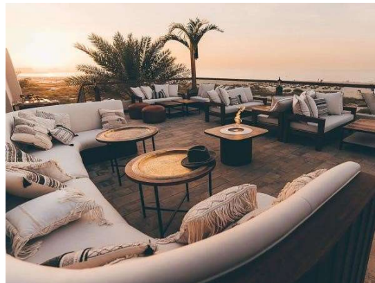
Figure 23. Shala