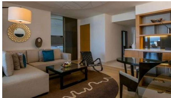
Figure 4. Park Suite

130 sq m room combining contemporary style with UAE's cultural touches featuring separate bedroom, living room, and two large balconies.