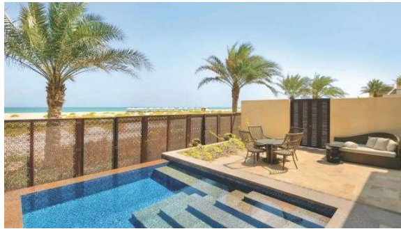
Figure 13. 1 Bedroom with Beach View Villa

200 sq m villa on the beach side of the hotel featuring a living room, two bedrooms, one maid's room, large terrace with a private pool and sunbeds, as well as dining terrace for your guests, offering a stunning views of the Arabian sea.