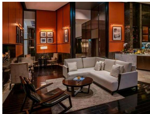
Figure 26. Library Café