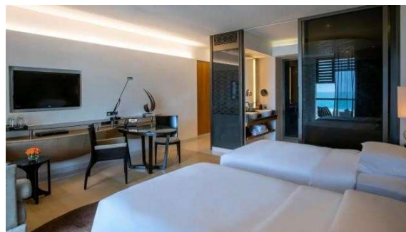
Figure 11. 2 Twin Beds with Sea View

50 sq m room featuring a spacious private balcony, this room features 2 twin beds, sofa, work area, internet access, and other modern amenities.