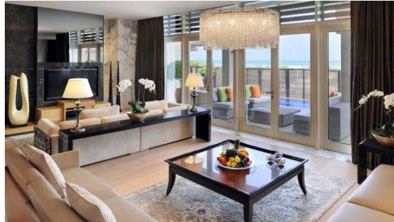
Figure 15. Royal Villa

355 sq m villa furnished with spacious living room, master bedroom, maid's room, large outdoor terrace with private pool and sunbeds with the stunning views of the Arabian Sea.