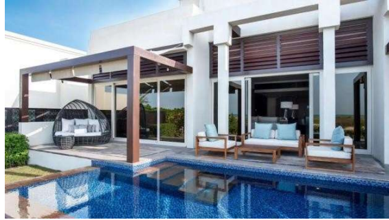
Figure 12. Executive Villa

200 sq m villa on the beach side of the hotel featuring a living room, two bedrooms, one maid's room, large terrace with a private pool and sunbeds, as well as dining terrace for your guests, offering a stunning views of the Arabian sea.