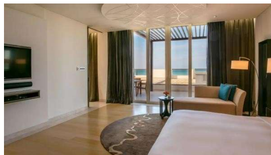
Figure 5. Park Terrace Suite

100 sq m suite for guests to experience a serene island retreat away from the bustle of the city in a luxurious suite combining contemporary style with the UAE's cultural touches.