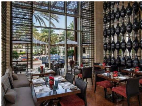
Figure 20. Café Restaurant