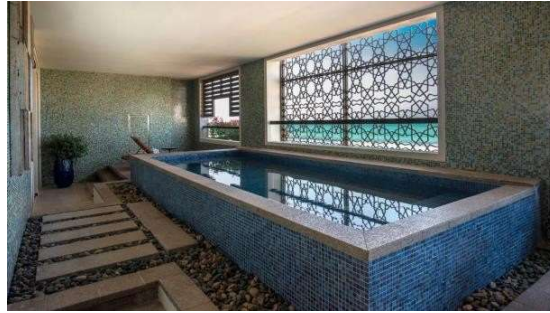
Figure 6. Presidential Suite

275 sq m room furnished with dining table up to 10 guests, plush sofas, armchairs, smart TV, luxurious bathrooms, maid's room, plunge pool, four sunbeds, private outdoor massage area.