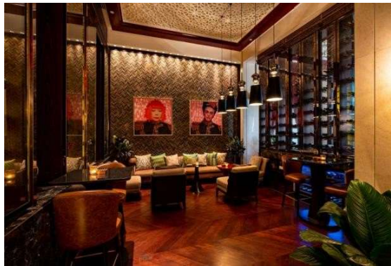
Figure 22. Mate Restaurant

Argentinian restaurant with a famous live asado grill in front of the guests.