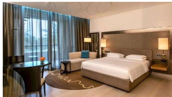
Figure 8. 1 King Bed

50 sq m room featuring a spacious and furnished private balcony. This room features a plush king bed, a sofa, work area, internet access, smart TV and other modern amenities.