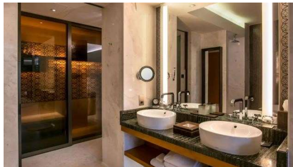
Figure 10. 2 Twin Beds

50 sq m room with stunning views of the Arabian Sea, furnished with private balcony, featuring a plush king bed, sofa, work area, internet access, and other modern amenities.