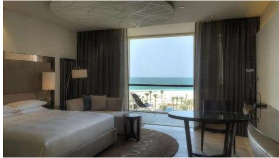
Figure 9. 1 King Bed with Sea View

50 sq m room with stunning views of the Arabian Sea, furnished with private balcony, featuring a plush king bed, sofa, work area, internet access, and other modern amenities.