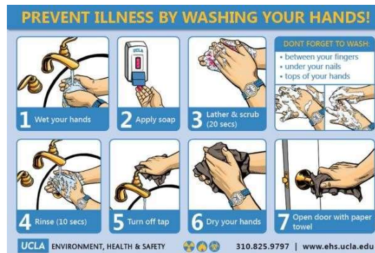
Figure 28. Proper Hand Washing

Personal Hygiene starts with washing our hands before entering the kitchen area. Wash your hand after preparing foods or before preparing foods. Always use hand gloves whenever doing cooking or in contact with the customer.