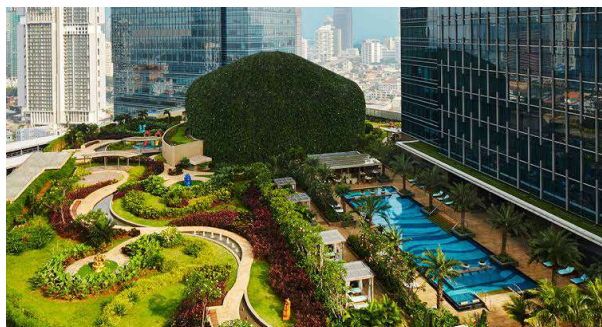
Figure 3. Raffles Jakarta Pool & Garden