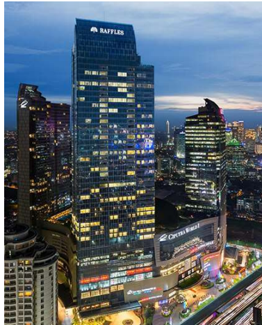
Figure 1. Raffles Jakarta Building

rooms will be fully booked and based on the real story, the employees are even overwhelmed.