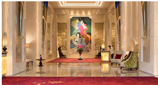
Figure 2. Raffles Jakarta Lobby