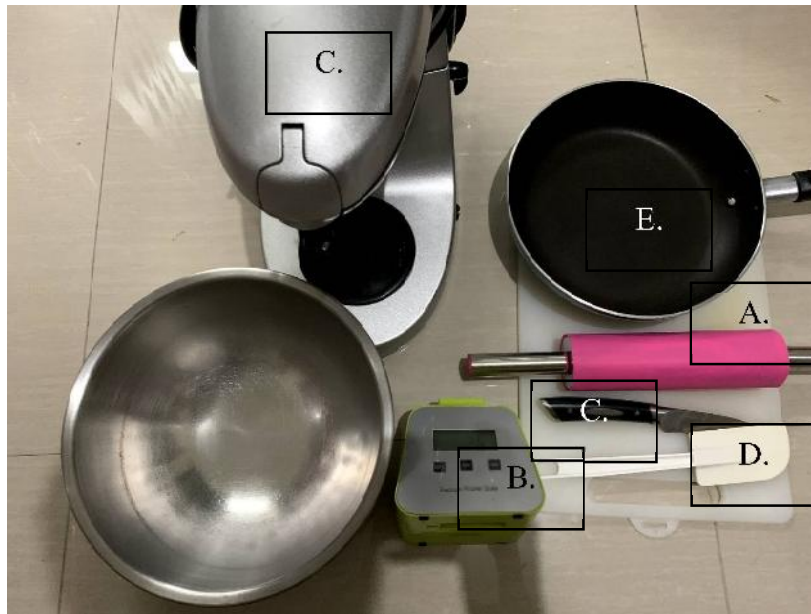
Picture 5. Tools for Making Product

The author used this tool to make Jackfruit Seed Pasta :