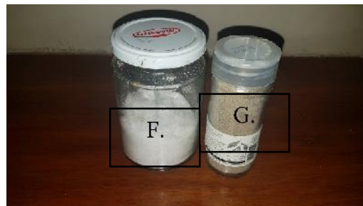
Picture 4. Salt and Pepper