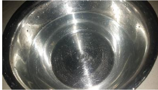
Picture 3. Mineral Water