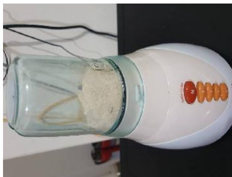
Picture 6. Blender