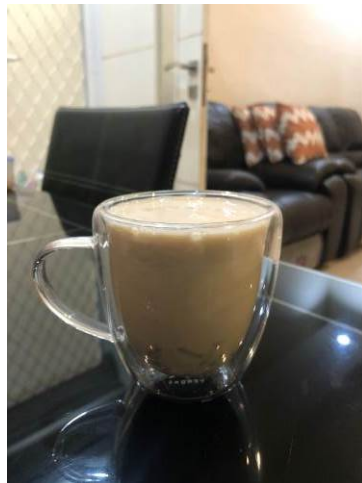
Picture 17. Unpacked Product