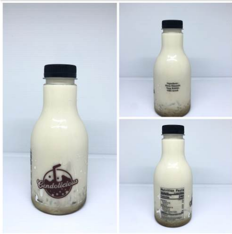
Picture 18.Packed Product