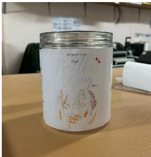
Picture 14.. Packed Product