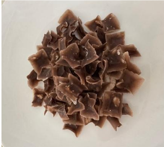
Picture 13.. Unpacked Product