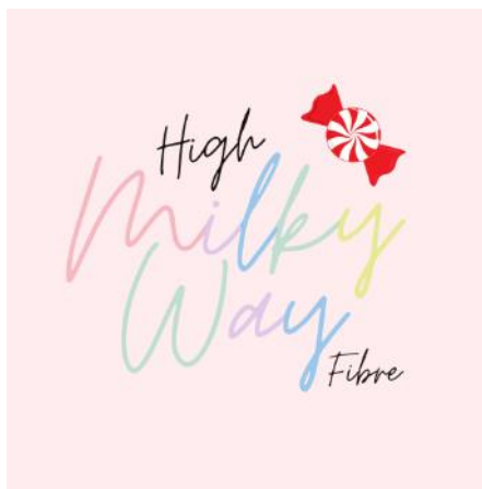
Picture 12.. Logo