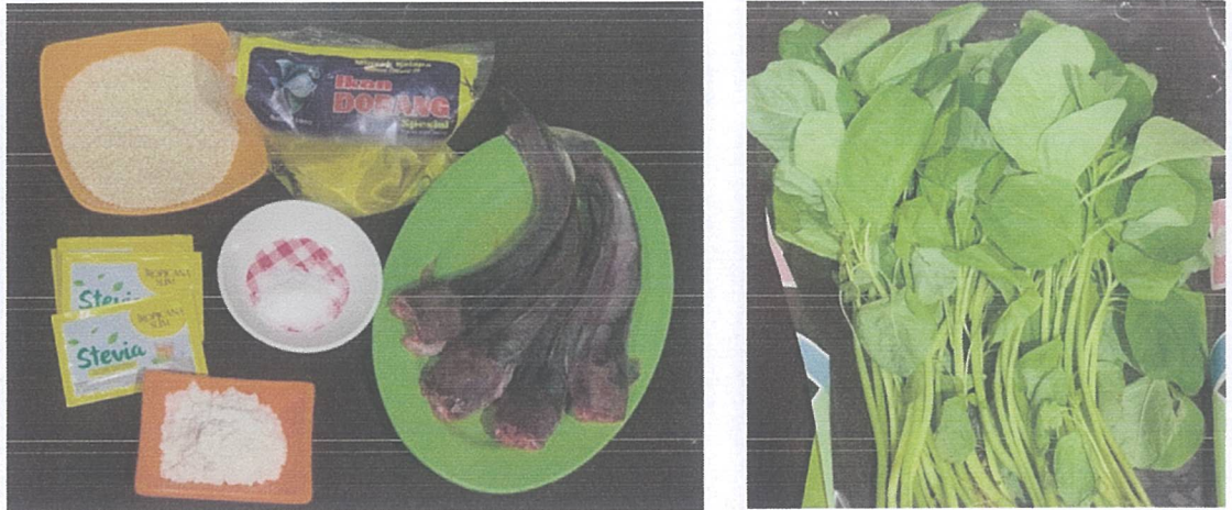
Picture 1 The Material to be Used