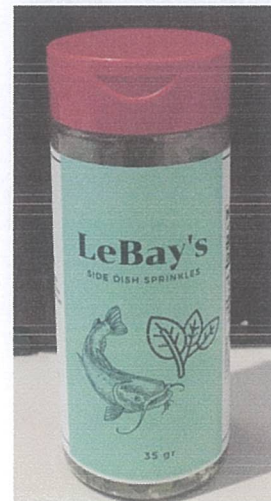
Picture 18 Unpacked and Produk Packed