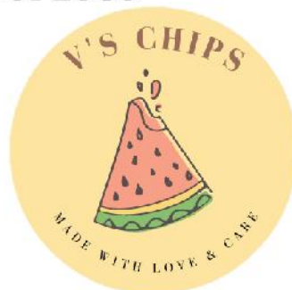
Picture 57. Logo