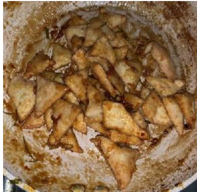
Picture 58. Unpacked Product