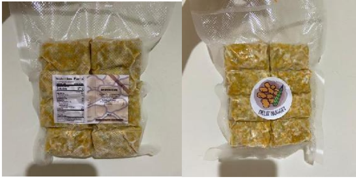
Picture 37. packed nugget