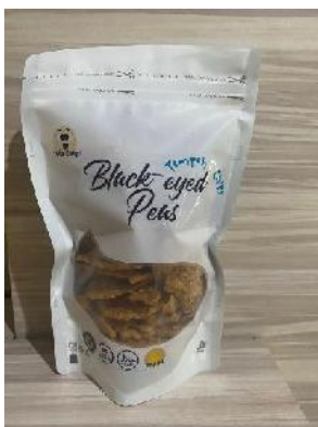
Picture 16 Packed Product