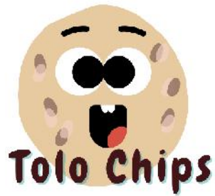
Picture 14 Product Logo