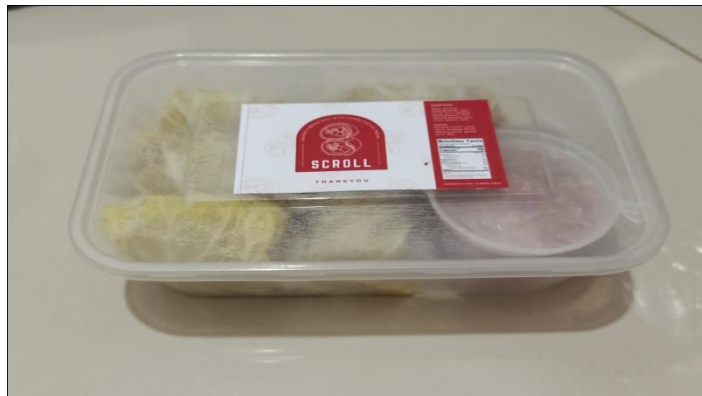
Picture 32. Packed Product