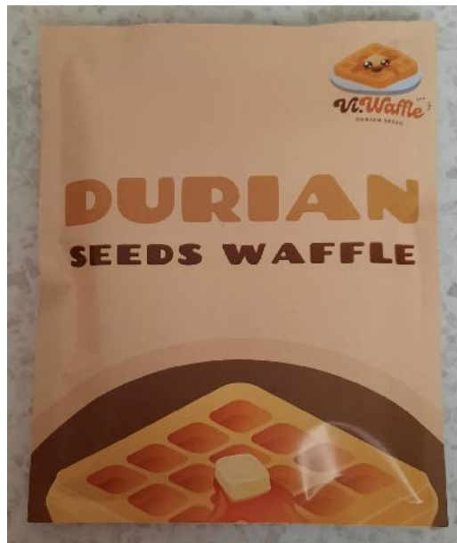
Figure 29. Packed Product