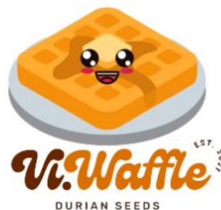
Figure 27. Logo