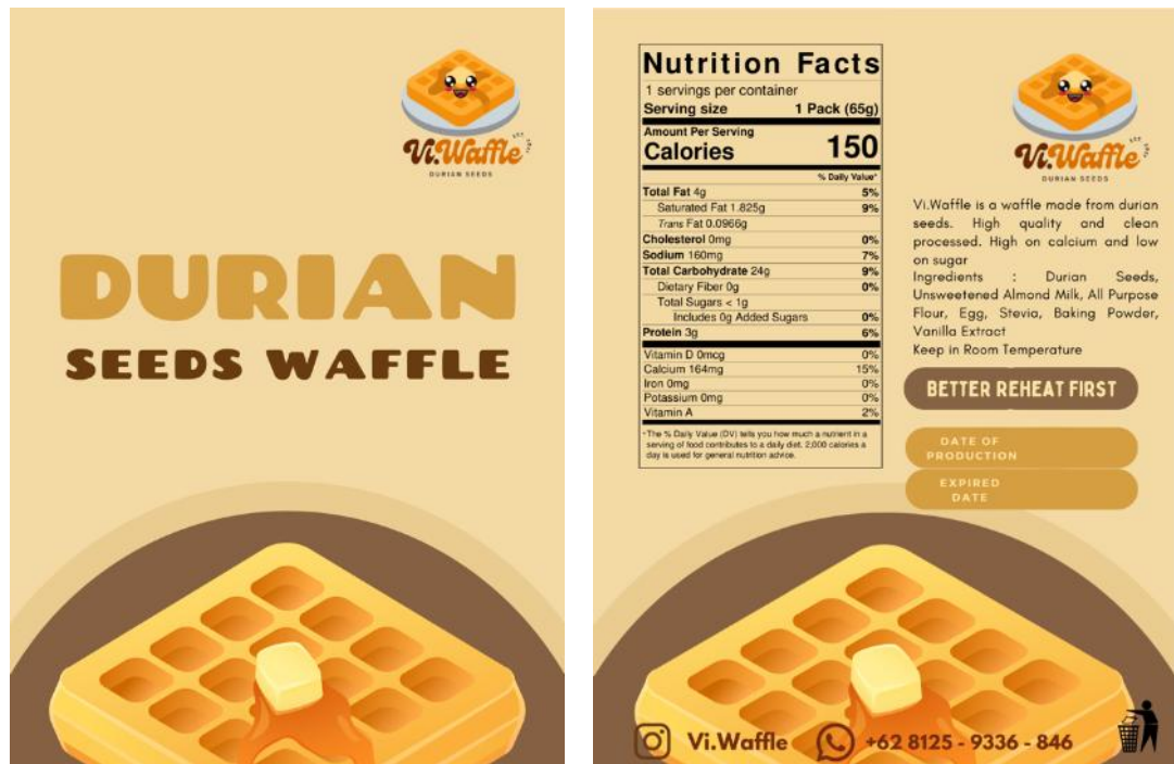
Figure 26. Design Packaging