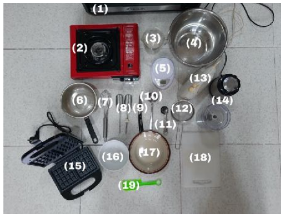
Figure 3. Tools and Equipment to be Used