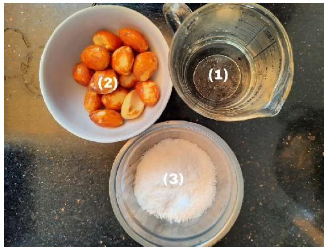
Figure 1. Ingredients to be Used