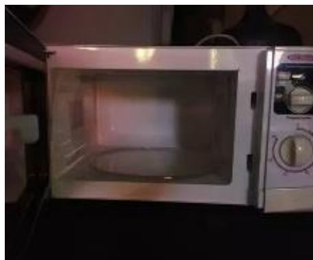
Picture 7. Microwave