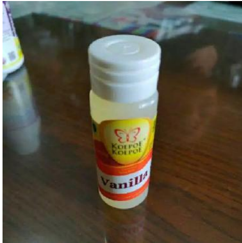
Picture 2. Vanilla Essence