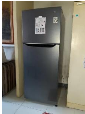
Picture 6. Refrigerator