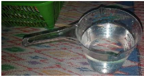
Picture 3. Mineral Water