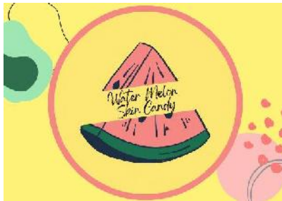
Picture 9. Sticker Label

m. Glass Jar, used as packaging product.