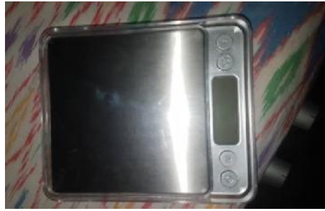
Picture 5. Scales