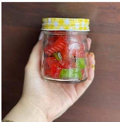
Picture 8. Glass Jar

m. Glass Jar, used as packaging product.