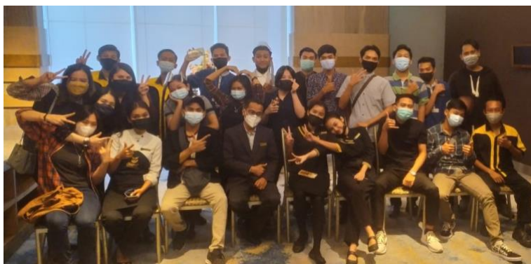
Picture 86. Trainees' Farewell Event (Personal Documentation, 2021).