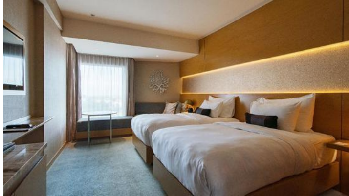
Figure 2. Premium Room

Premium Rooms offer the same layout and features as the Select Rooms, but our Premium Rooms are located on the higher floors, offering breathtaking views over Surabaya and feel the experience of personalized service with access to our Executive Club Lounge during your stay. In addition, these 32 square meters of rooms come with a full range of upsized bathroom amenities.