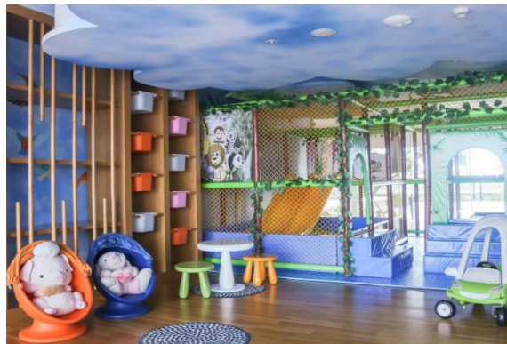
Figure 25. Children Playground

Our Children's Playground on the fifth floor features games, toys and enriching activities to give parents complete peace of mind. Children must use socks and be supervised by an adult.