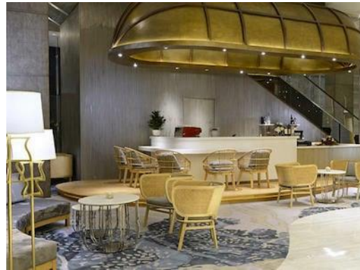
Figure 14. Lobby Lounge

The effortless style and elegance of our Lobby Lounge make it the perfect spot for unwinding with colleagues or catching up with friends. Savor an extensive cocktail and wine selection along with delicious pastries.