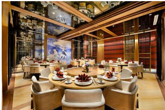
Figure16. Xiang Fu Hai

At Xiang Fu Hai, our culinary team strives to bring you the healthiest, freshest and most authentic Chinese and Cantonese cuisine. Our food is prepared with the best ingredients, offering detailed preparation and years of experience that come together to create the finest dishes. Xiang Fu Hai is open daily for lunch and dinner. Dim Sum is also available every Saturday and Sunday, and on public holidays.