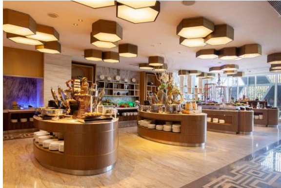
Figure 15. 209 Dining