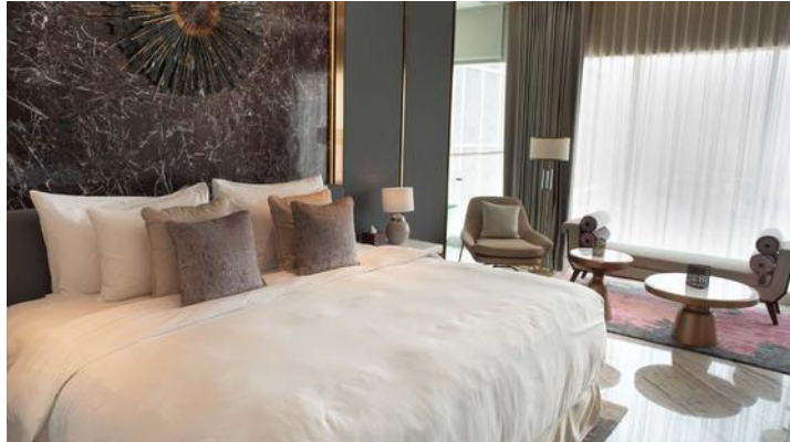
Figure 6. Royal Suite