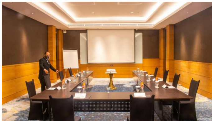
Figure 21. Meeting and Conference Room

Boasting first-class meeting rooms and personalized event planning and catering, Vasa Hotel Surabaya is the perfect location for your business gathering. Designed to accommodate signature events that leave a lasting, impressive array of event spaces.