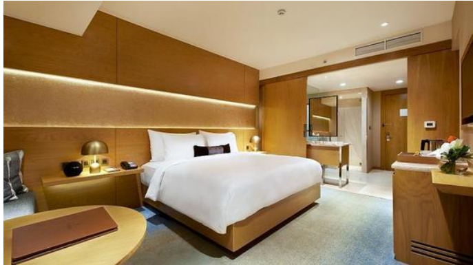
Figure 3. Executive Room