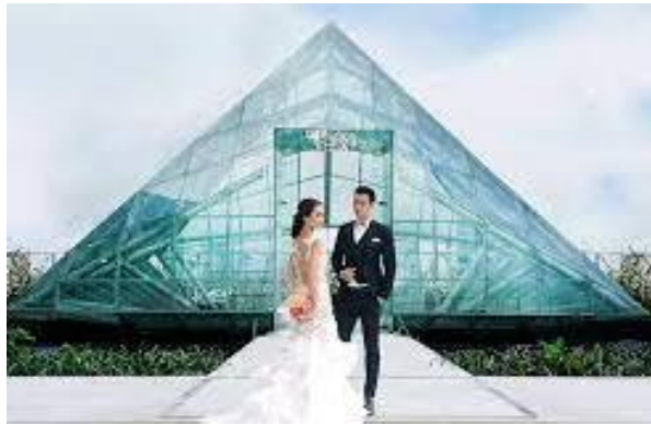
Figure 20. Aviosa Wedding Chapel

Vasa offers unique way to deliver your wedding dreams, they have chapel in their 5 th floor, open air, and romantic way to say you vow with your love one.