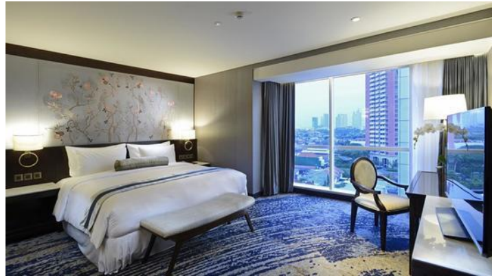
Figure 5. Breccia Suite

Our spacious 70 square meters Breccia Suites have a separate living area, a luxurious bathroom with a shower and a bath as well as a wide range of bathroom amenities. The bedroom also features a plush King bed. Enjoy the complimentary Executive Club Lounge access while staying in our Breccia Suites. Benefits include private check-in and check-out, breakfast, all-day coffee & tea, also social hour at 06.00 pm - 08.00 pm.