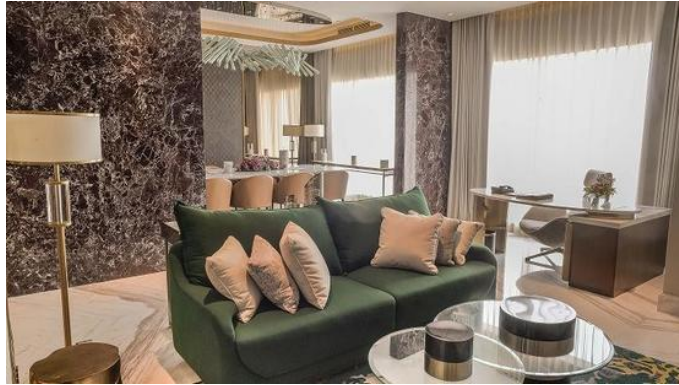
Figure 8. Presidential Suite Living Room