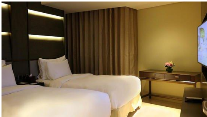
Figure 13. Three-Bedroom Apartment

Boasting three bedrooms and two bathrooms, a living room, a kitchen, and a dining area, our 132 square meters large apartment can accommodate up to six guests. Experience personalized service with access to our Executive Club Lounge during your stay, inclusive breakfast, all-day coffee & tea, and social hour at 06.00 pm - 08.00 pm.