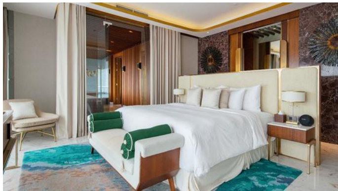
Figure 7. Presidential Suite

A stunning sophisticated design welcomes you within the Presidential Suite; the curated artwork creates a sense of private, residence-style sophistication. This 192 square meters suite accented with elegant design with large floor-to-ceiling windows with natural light that continues into the in-room swimming pool with breathtaking city views of this bespoke. Enjoy the complimentary Executive Club Lounge access. Benefits include private check-in and check-out, breakfast, all-day coffee & tea, also social hour at 06.00 pm - 08.00 pm.