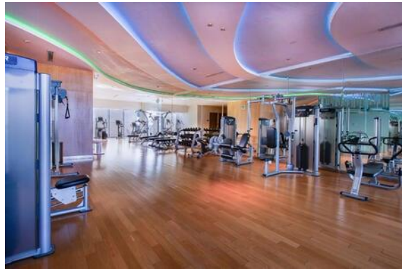
Figure 24. Fitness Center

Taking a break from your daily routine does not have to mean taking a break from your exercise routine. Travel and fitness can work together to create a happier and healthier. Maximize your stay when you use our state-of-the-art fitness equipment in Flex & Fit. Fitness Center is located at 5 th floor.