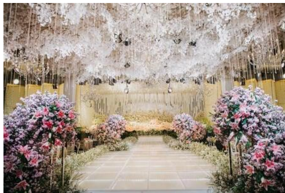
Figure 19. Ballroom and Pre-Function Hall

Set the stage for any occasion. The spectacular décor and design of The Grand Ballroom, together with its luxurious table settings, great cuisine, and committed service makes it the ultimate venue for the most successful events.