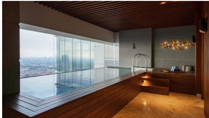
Figure 9. Presidential Suite Swimming Pool