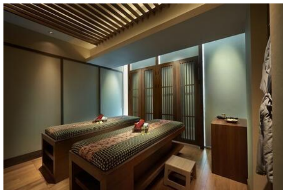
Figure 23. Spa

We believe that a balance between exertion and relaxation is the key to achieving a feeling of inner tranquility and rejuvenation. Our therapist will guide you a treatment to rediscover mental, physical, and spiritual harmony, leaving you feeling enlivened and transformed.