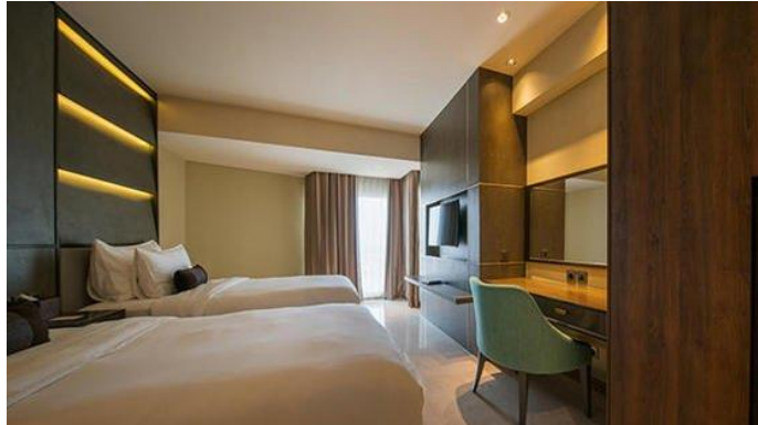
Figure 12. Two-Bedroom Apartment