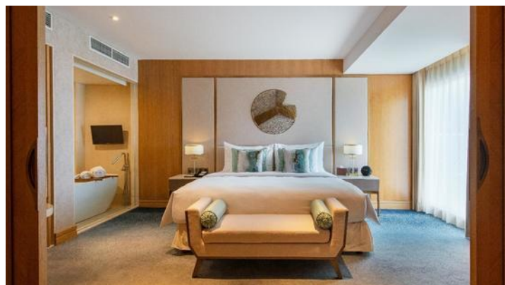
Figure 4. Glacier Suite

Our spacious 64 square meters Glacier Suites can be found on the 32nd to 36th floor, offering panoramic views over Surabaya. These suites have a separate living area, a luxurious bathroom with a shower and a bath as well as a wide range of selected amenities. Enjoy the complimentary Executive Club Lounge access during your stay. Benefits include private check-in and check-out, breakfast, all-day coffee & tea, also social hour at 06.00 pm - 08.00 pm.