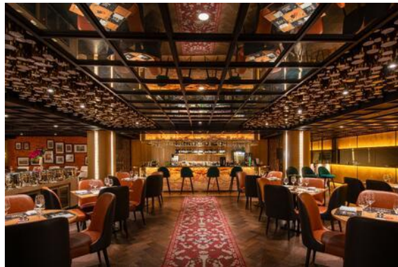
Figure 17. Chamas Brazilian Churrascaria

The first Brazilian Churrascaria Restaurant in Surabaya where the new dining concept of the Brazilian Steak house with unlimited high-quality meat; 17 varieties of beef, lamb, and chicken as well as excellent beverage selections are served. Each meat has been seasoned with sea rock salt the authentic South American way and slow-roasted over an open flame. The menu will be served by the attentive service team in Gaucho costume (South Brazilian local ranchers) where they will move from table to table, carry and slice portions of unlimited meat skewers. Savor the real and delicious meat in Brazilian authentic cuisine. Chamas Churrascaria is open daily for lunch and dinner.