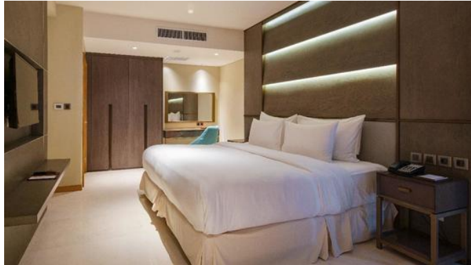
Figure 10. One-Bedroom Apartment