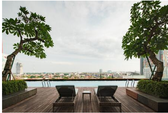
Figure 22. Swimming Pool

Located on the 5th floor, our outdoor swimming pool is available exclusively for hotel guests, offers the perfect venue to simply enjoy a refreshing dip.