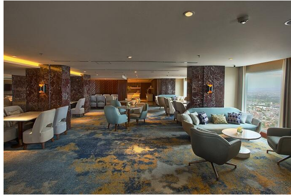
Figure 18. Executive Lounge

This lounge located at the 33 rd floor. It's include at VIP guest private area so they can hang out and having 24 hours bar without have to go down at the lobby lounge area.