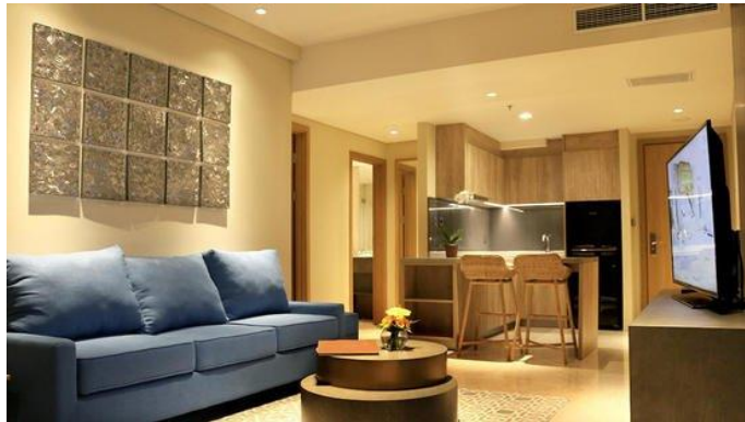
Figure 11. One-Bedroom Apartment Living Room