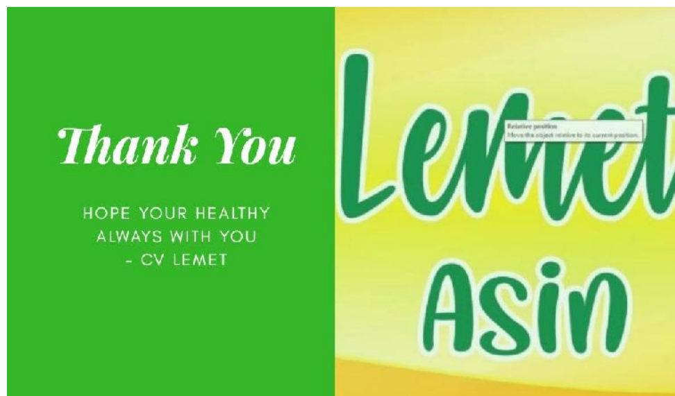
Picture 45. Company Profile Closing

In this picture, the author will introduce the new product to new customer.