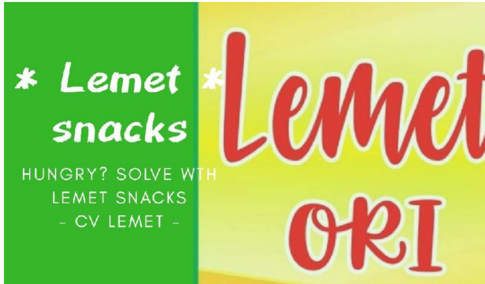
Picture 40. Company Profile cover

In here the author will tell about this profile about company, and hope giving more information.