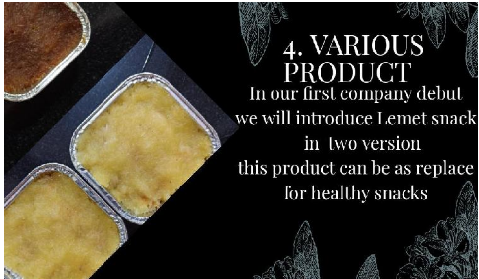
Picture 44. Company Profile Various Product

In this picture, the author will tell about business, goal business and goal target.