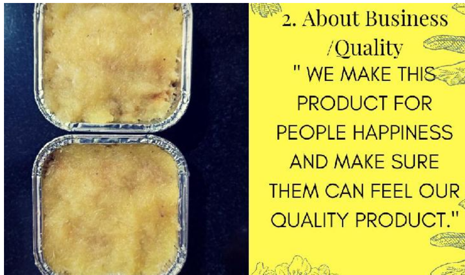
Picture 42. Company Profile Quality

In this picture, the author will explain as briefly about attracting new customer to our product.