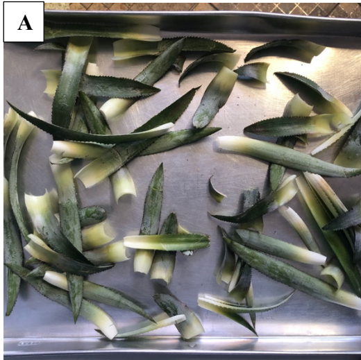
Figure 1. Ingredients Used

A. Pineapple leaves: the main ingredient in making Crown Tea