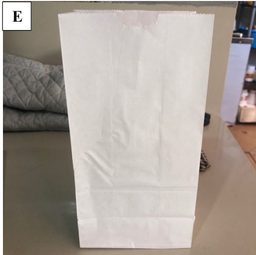
Figure 6. Tools Used

D. Strainer : to filter the pineapple leaves