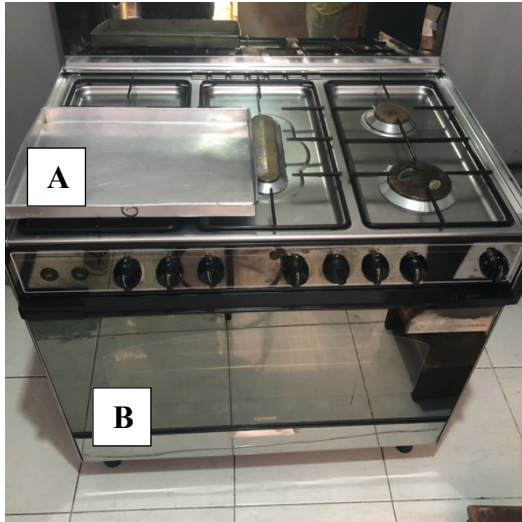
Figure 3. Tools Used