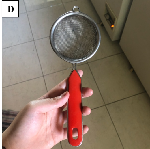
Figure 5. Tools Used

D. Strainer : to filter the pineapple leaves