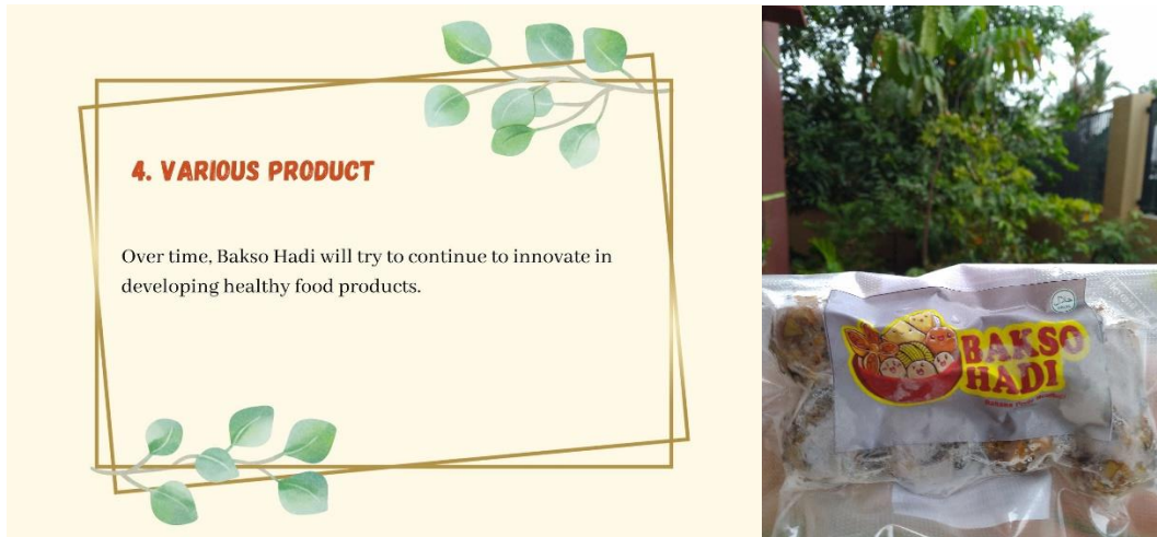
Picture 7. Company Profil Various Product

Over time, Bakso Hadi will try to continue to innovate in developing healthy food products.