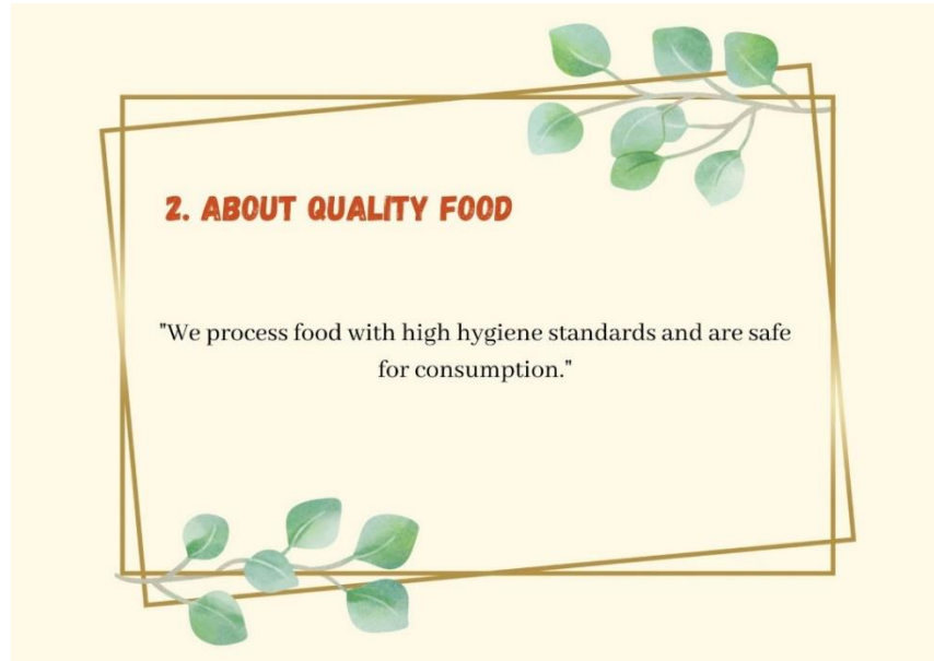
Picture 5. Company Profile About Quality Food

In this picture we give a slogan to attract the attention of consumers.