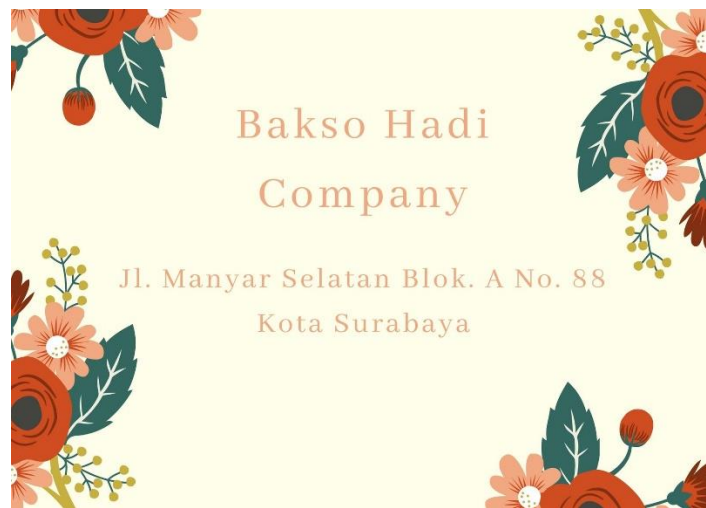
Picture 2. Company Profile Bakso Hadi