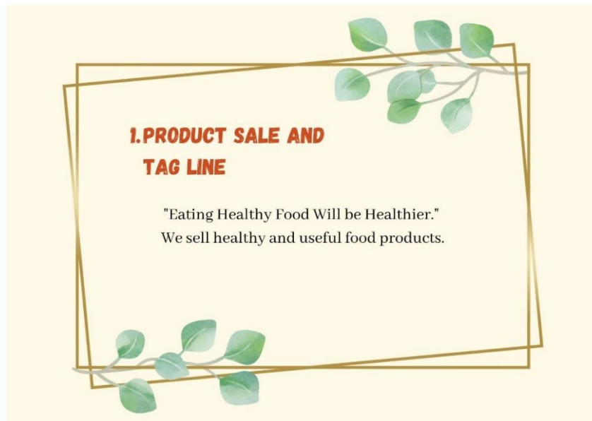
Picture 4. Company Profile Product Sale and Tag Line

In the photo is a journey about the company that was established and making healthy food for consumers.