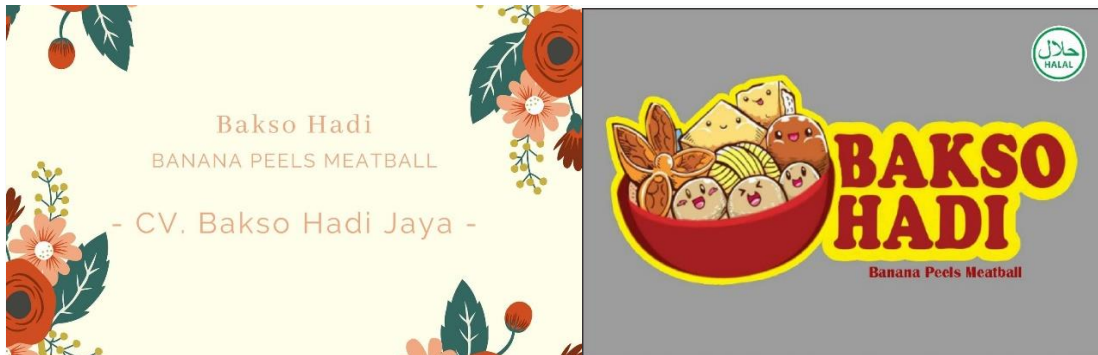
Picture 1. Company Profile Cover

The author will explain the form of the company about this product and will give a little info.