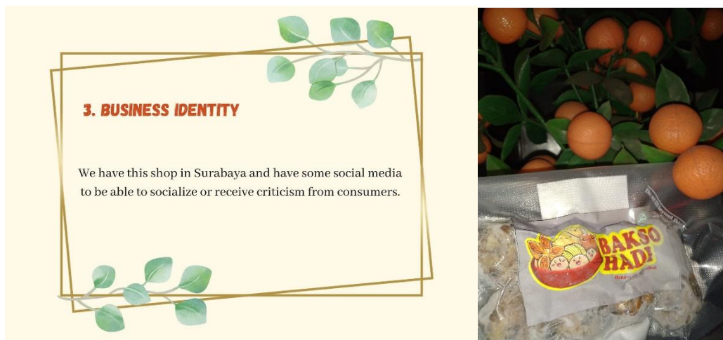
Picture 6. Company Profile Business Identity

In this picture, the author wants to provide information that this product is processed with high hygiene so that consumers are safe in consuming food from our products.