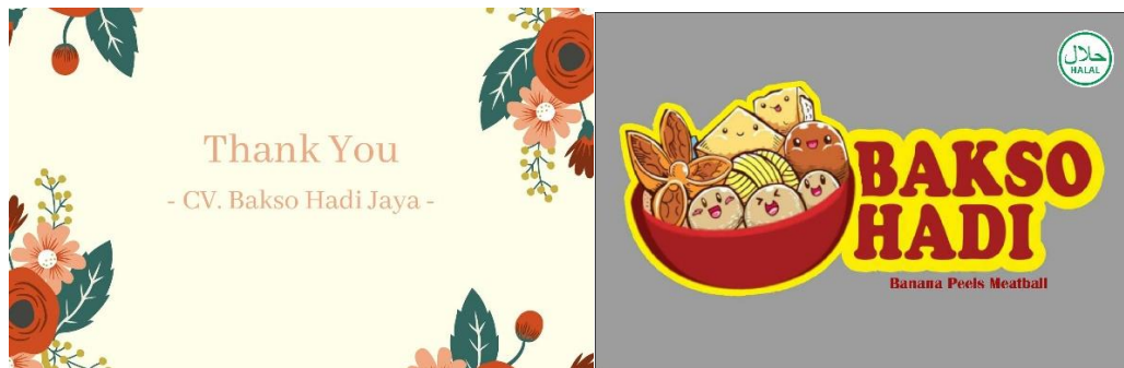
Picture 8. Company Profile Closing

Over time, Bakso Hadi will try to continue to innovate in developing healthy food products.