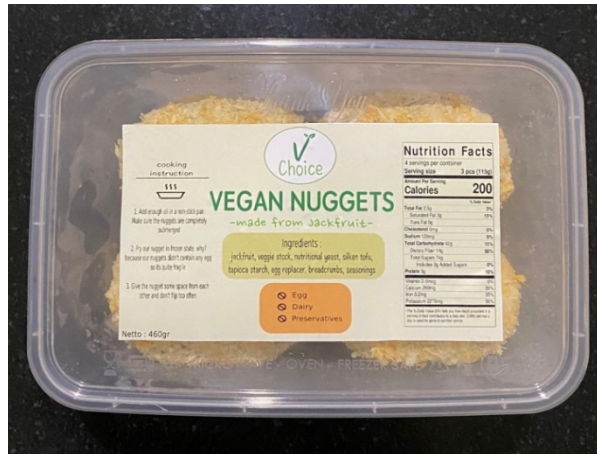
Figure 45. Label on the Pack