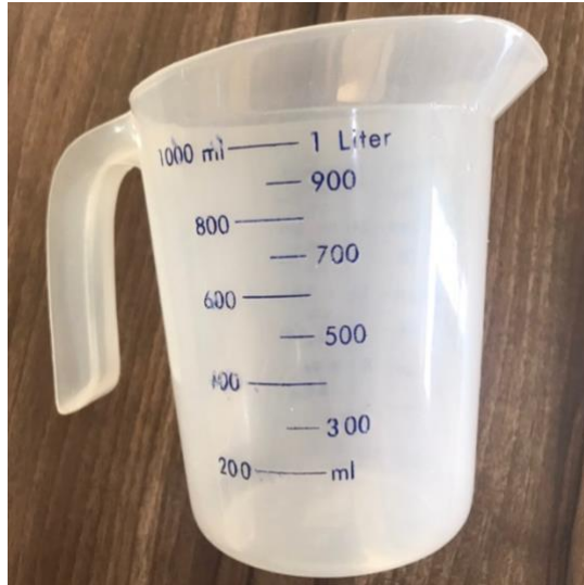
Figure 11. Measuring Glass (Personal Documentation, 2020). Used to measure the water quantity.