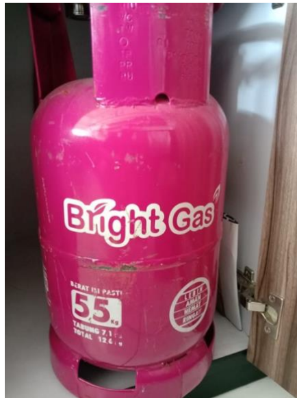
Figure 15. Liquefied Petroleum Gas. Used to fuel the stove.