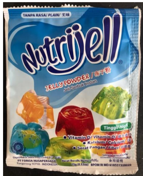
Figure 7. Jelly Powder.