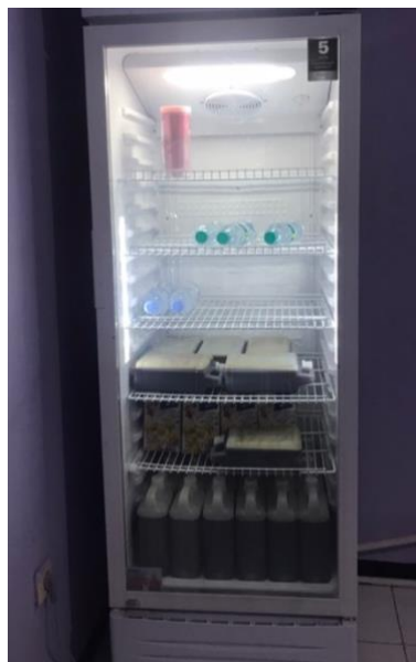
Figure 16. Refrigerator (Personal Documentation, 2020). Used to chill the jelly.