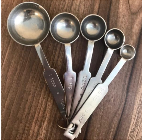
Figure 21. Measuring Spoon (Personal Documentation, 2020).

Used to measure and scoop the ingredients.