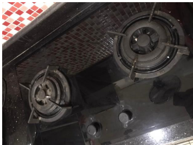
Figure 14. Stove.

Used to produce heat for the cooking process.