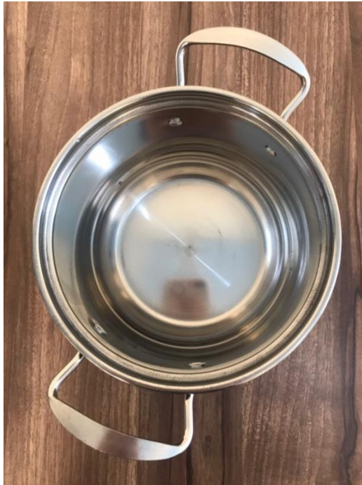
Figure 13. Cooking Pot (Personal Documentation, 2020).