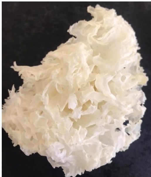
Figure 4. Snow Fungus (Personal Documentation, 2020).

One of the few additional ingredients that is in the product.