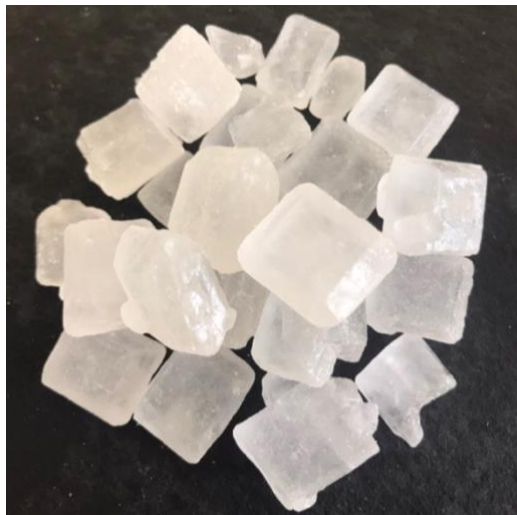
Figure 6. Rock Sugar (Personal Documentation, 2020). To sweetened the product.