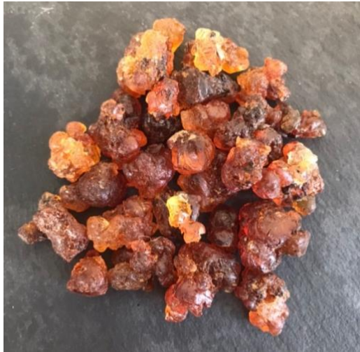
Figure 1. Peach Gum (Personal Documentation, 2020).

Peach gum is the main ingredient of the product.