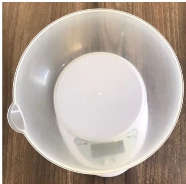
Figure 12. Kitchen Electric Scale (Personal Documentation, 2020). Used to measure the precise amount of ingredients used.