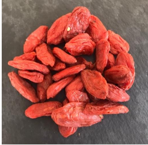
Figure 3. Goji Berries (Personal Documentation, 2020).

One of the few additional ingredients that is in the product.