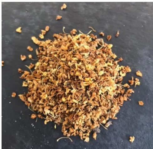
Figure 2. Osmanthus Tea (Personal Documentation, 2020).

The ingredient that gives the aromatic fragrance and flavour for the product.