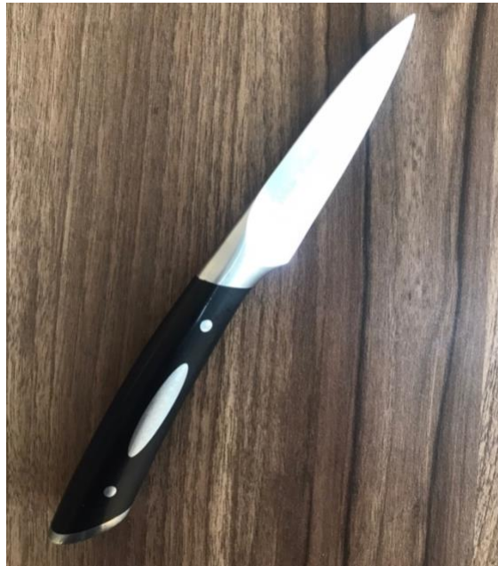
Figure 18. Knife (Personal Documentation, 2020).