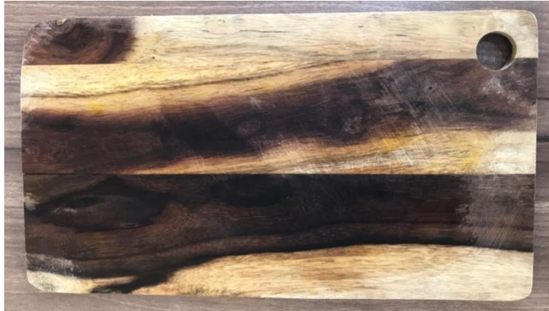
Figure 19. Cutting Board (Personal Documentation, 2020). Used as the base to cut the jelly.