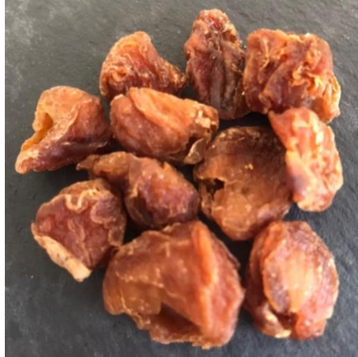
Figure 5. Dried Longan (Personal Documentation, 2020) One of the few additional ingredients that is in the product.