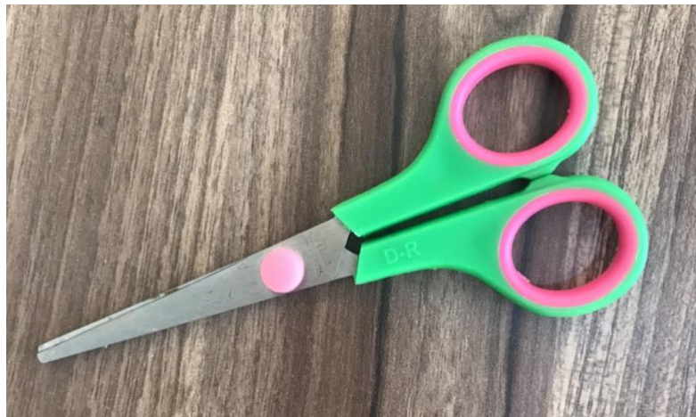
Figure 20. Scissor (Personal Documentation, 2020).

Used to cut open the ingredients' packaging. Also used to cut the sticker labels for the product packaging.