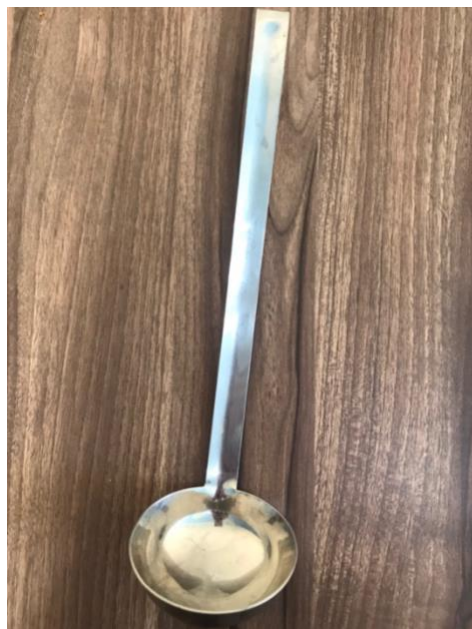
Figure 10. Ladle (Personal Documentation, 2020).

Used to stir the jelly mixture while cooking and to help pour the jelly mixture to the moulds.