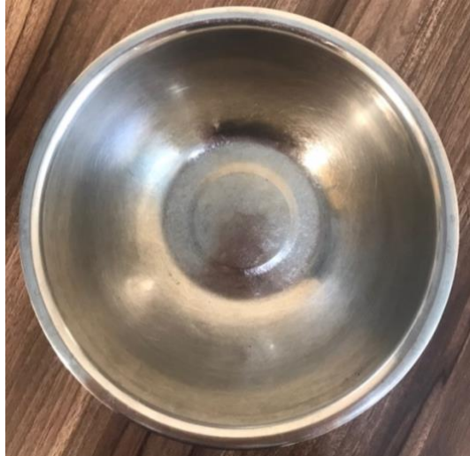
Figure 9. Bowl (Personal Documentation, 2020).

Used to soak the Peach Gum and Snow Fungus.