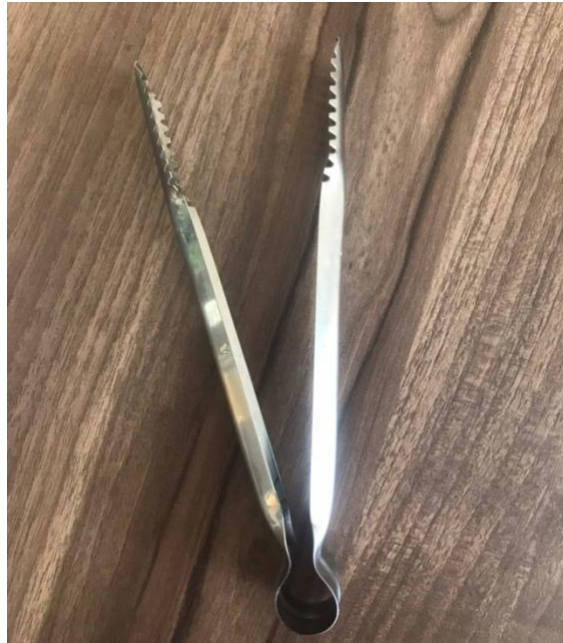
Figure 17. Kitchen Tongs (Personal Documentation, 2020).

Used to take the bottle jar out of the hot water during sterilisation.