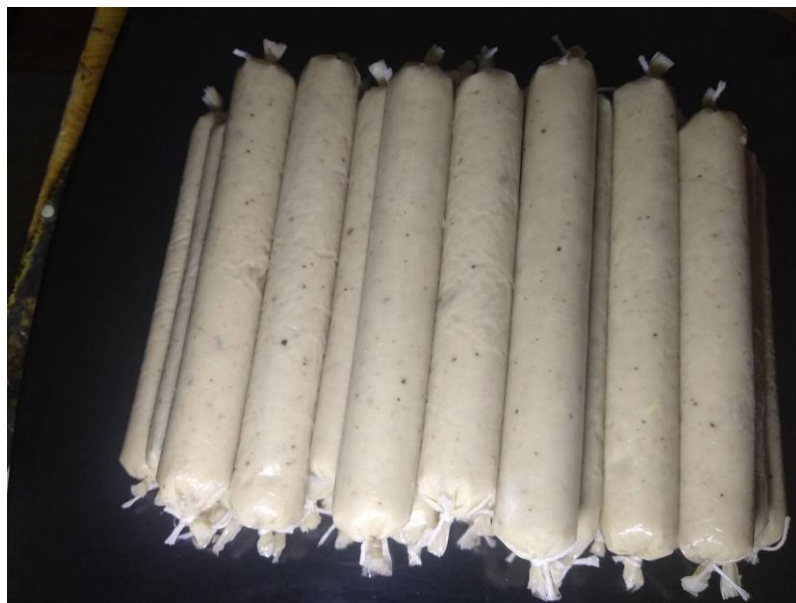
Picture 26. Product before Packaging