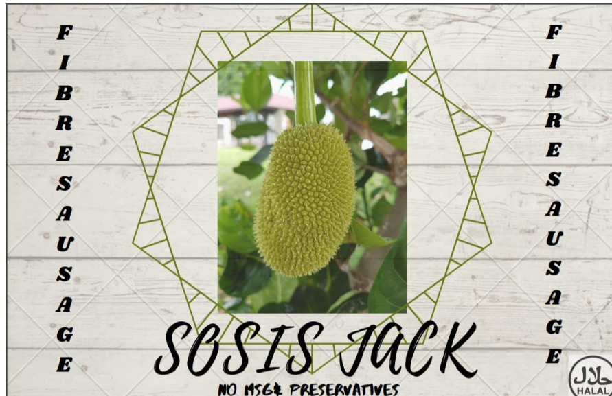
Picture 25. Logo Picture