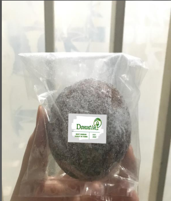
Donat Kulit dan Biji Durian