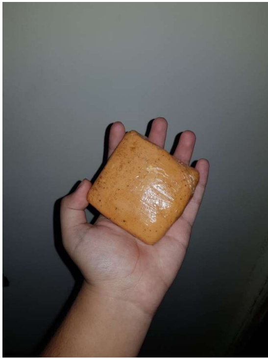
Picture 20. Before Packaging