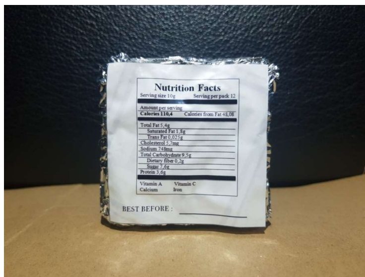
Picture 18. B''que Packaging Back Side