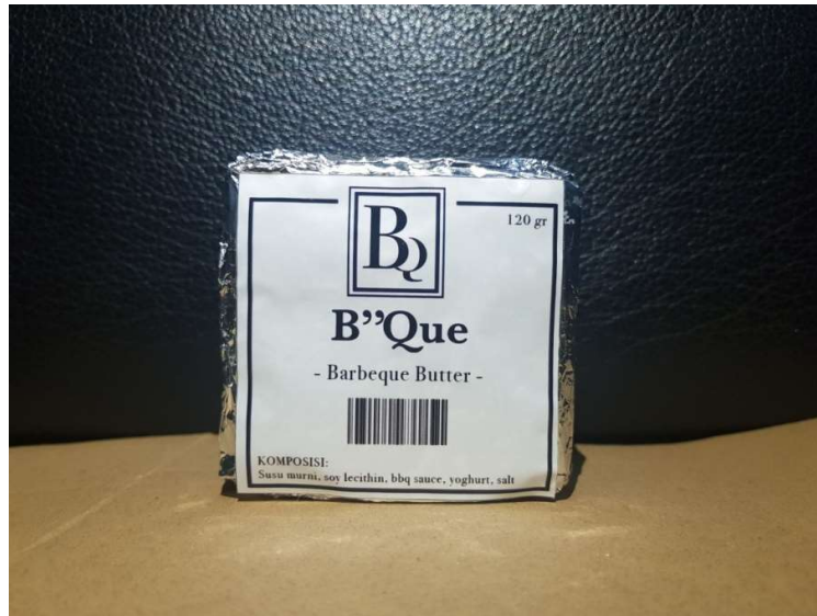
Picture 17. B''que Packaging Front Side