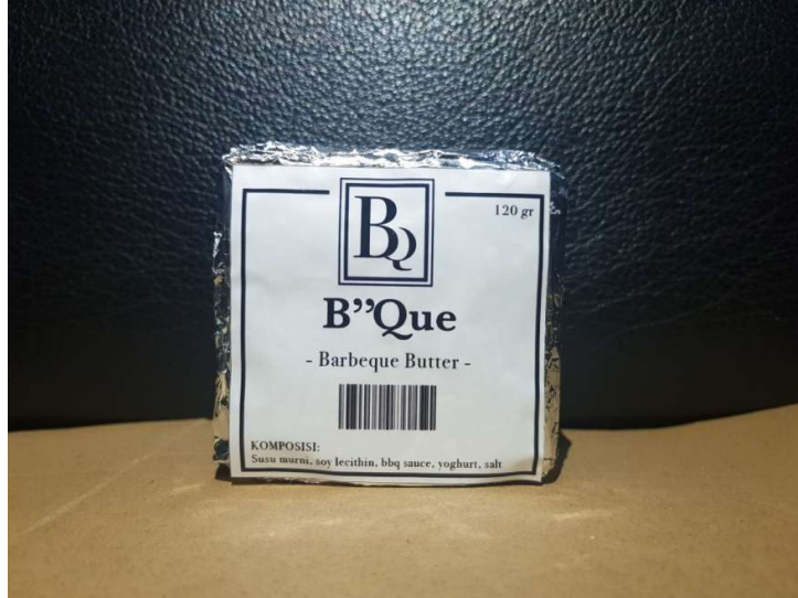
Picture 21. After Packaging