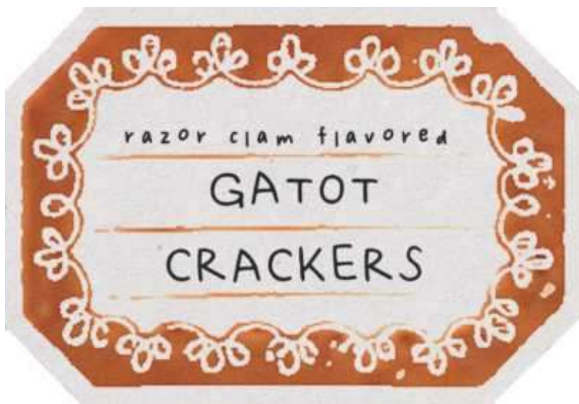
Picture 42. Product Logo