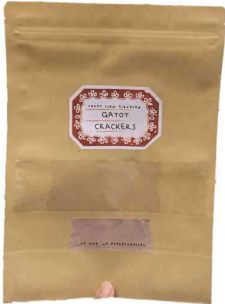
Picture 40. Packaging Front Side