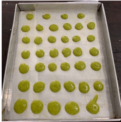
Picture 39. Shaped Batter In A Baking Sheet (Personal Documentation, 2019)

7.2.4.1. Put the batter according to the desired shape into a baking sheet.