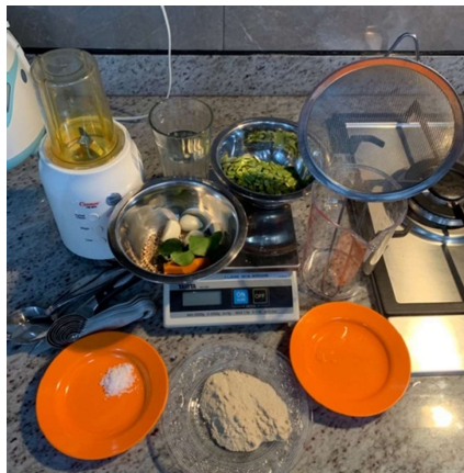
Picture 34. All Ingredients and Utensils (Personal Documentation, 2019)