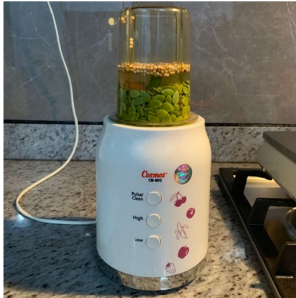
Picture 35. Some Ingredients In A Food Processor (Personal Documentation, 2019)

7.2.2.1. Put lamtoro, garlic, turmeric, lime leaf, coriander, and water into a food processor.