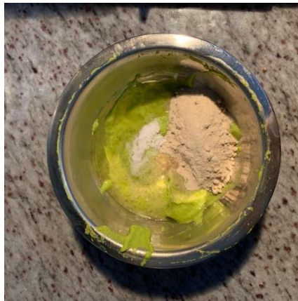
Picture 38. Lamtoro Juice and Other Ingredients (Personal Documentation, 2019)

Mix the strained lamtoro juice with flour, eggs, and salt into a bowl with a spoon.