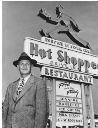
Picture 2.2. J. Willard Marriott and his HotShoppes stand (Marriott, 2022)