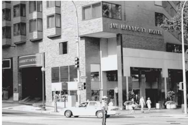
Picture 2.3. First JW Marriott Hotel in Washington, DC(Marriott, 2022)

Marriott International broke new ground in its quest to become the number one hospitality in the world by pioneering the extended-stay business to launching distinctive brands geared toward the business traveller to increasing its presence overseas. Throughout 1987-1997, Marriott becomes first lodging company to offer portfolio brands and acquires Residence Inn, 49% interest in Ritz Carlton Hotel company and Renaissance Hotel Group.