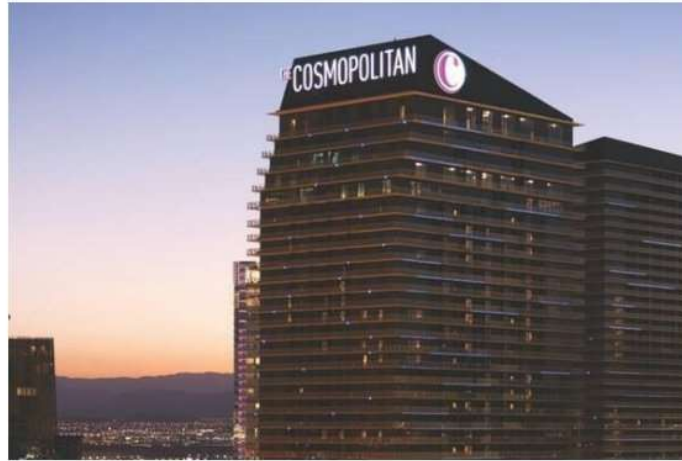
Picture 2.4. Launching of Autograph Collection brand in 2009(Marriott, 2022)

From 2012 and present, Marriott acquires Gaylord Hotels Brand, debuts Moxy Hotels in Europe, acquires Delta Hotels and Resorts and Starwood Hotels and Resorts. Creating the world's largest hotel company with 5,700+ properties offering more than 1.1 million rooms across 30 brands in over 110 countries.