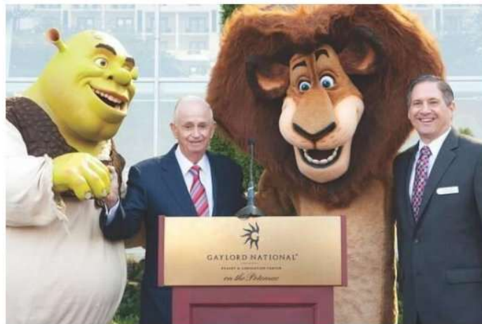
Picture 2.5. Marriott acquires Gaylord Hotels Brand in 2012(Marriott, 2022)

From 2012 and present, Marriott acquires Gaylord Hotels Brand, debuts Moxy Hotels in Europe, acquires Delta Hotels and Resorts and Starwood Hotels and Resorts. Creating the world's largest hotel company with 5,700+ properties offering more than 1.1 million rooms across 30 brands in over 110 countries.