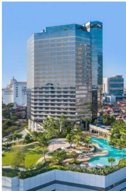
Picture 2.1. JW Marriott Hotel Surabaya

JW Marriott Hotel Surabaya is a five-star Luxury Brand among other Marriott's International subsidiary and is surrounded by some of Indonesia's most celebrated attractions. It was named The Westin Surabaya and transitioned to JW Marriott Surabaya in 1996. It is located in the heart of Surabaya with each room is designed in a luxurious European style. This hotel has 407 beautifully appointed rooms, including 145 twin bedrooms and 23 Apartments for extended stays. It also provides versatile meeting and event space with custom catering and expert planning. With ample self-parking space, health club facilities, an outdoor pool, 24-hour gym and massage treatment. It is minutes from Suramadu Bridge, the House of Sampoerna,