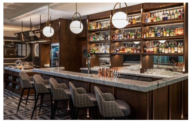
Figure 2.7 Uppercut Restaurant