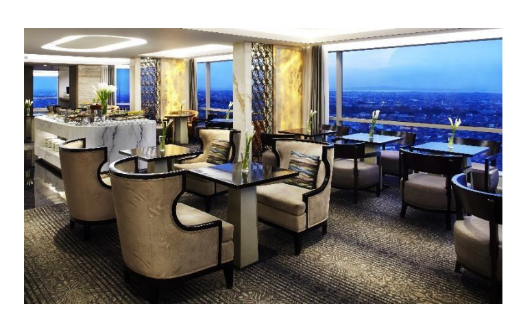
Figure 2.8 Excecutive Lounge