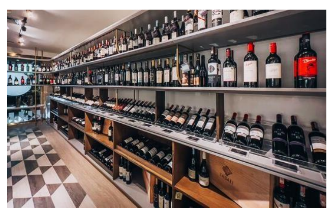
Figure 2.10 Wine and Co