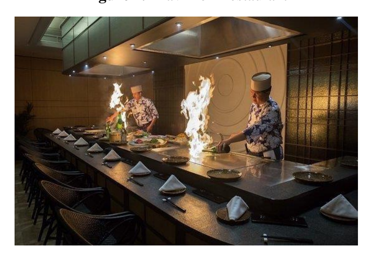
Figure 2.5 Imari Restaurant