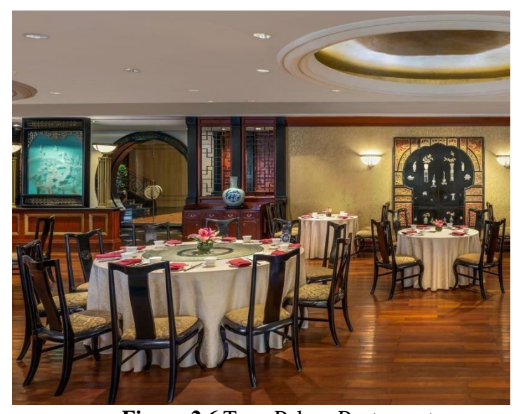
Figure 2.6 Tang Palace Restaurant