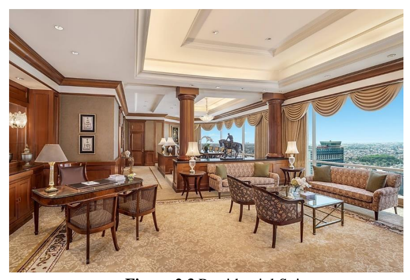
Figure 2.3 Presidential Suite

JW Marriott has 7 room types including Deluxe Premium, Deluxe Premium Twin, Junior Suite, Two Bedroom Suite, Residential Suites, Chairman Suite, Presidential Suite. During the high season, the average number of visitors increases to 90%-100%, while on weekdays it is 60%-75%.